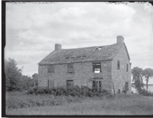
Waba Cottage, the Laird's house, seen here abandoned in 1935. It was later rebuilt and is now a museum. AO 10010824 C 120 3-0-0-152.