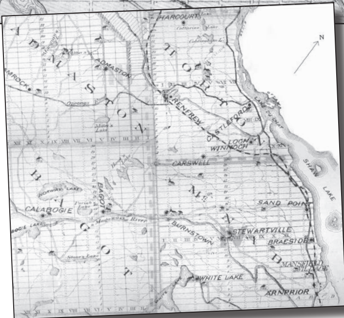
Above: McNab Township, part of Renfrew County, as seen in 1880, courtesy of the Canadian County Atlas Digital Project, < http://digital.library.mcgill.ca/County/Atlas >.