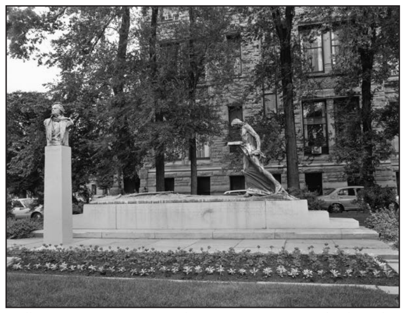
William Lyon Mackenzie Memorial in Queen's Park.

tute as Mackenzie King could seize upon. To mark each of these four phases—heroic revisionism, rehabilitative consensus, suppression of opposition material, reconfiguration of popular historical narrative—I have selected a representative,