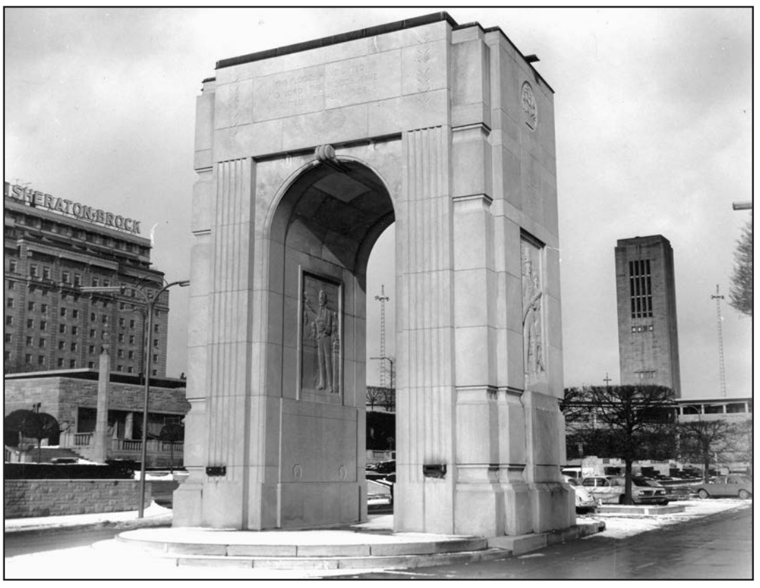
Clifton Memorial Arch.

of faith beheld a geometry as inevitable as the line from first base to home. The panels' deft assemblage of constituencies and historical worthies chiselled into the service of a common good could have caused no disquiet in the Prime Minister, himself expert in such constructions. Mackenzie King wanted the struggle for responsible government at once focused upon his ancestor yet decoupled from the Rebellion, and the panel certainly accomplished that.<sup>3</sup>