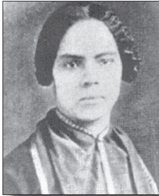
Mary Ann Shadd Cary.

It is clear that many, diverse African Canadians were involved in the temperance movement and that it occasioned a considerable amount of cooperation between Whites and African Canadians. As a result, many Blacks became loyal to tem-