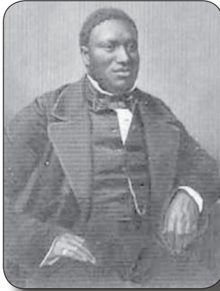
Samuel Ringgold Ward. From Samuel Ringgold Ward, Autobiography of A Fugitive Negro, His Anti-Slavery Labours in the United States, Canada, & England (London, 1855).

Although many African Canadians hoped that temperance would lead to respectability, not everyone chose that path. People who supported the right to drink saw themselves as pragmatic because they realized that White society would never fully accept them, whether they drank or not. Those who chose to drink did so for many reasons. For example, informal groups of Masonic lodges in the United States often created bonds through activities