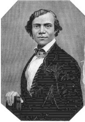
Henry Bibb. From Henry Bibb, Narrative of the Life and Adventures of Henry Bibb, An American Slave (New York, 1849).

against a society that fundamentally restricted their rights.