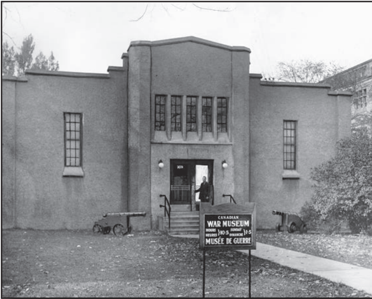
The Canadian War Museum on Sussex Street in Ottawa, October 1945.

to confiscate the weapons and impose stricter firearms legislation across the country.