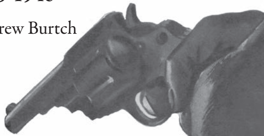
Illustration from Inside Detective magazine, Nov. 1937.