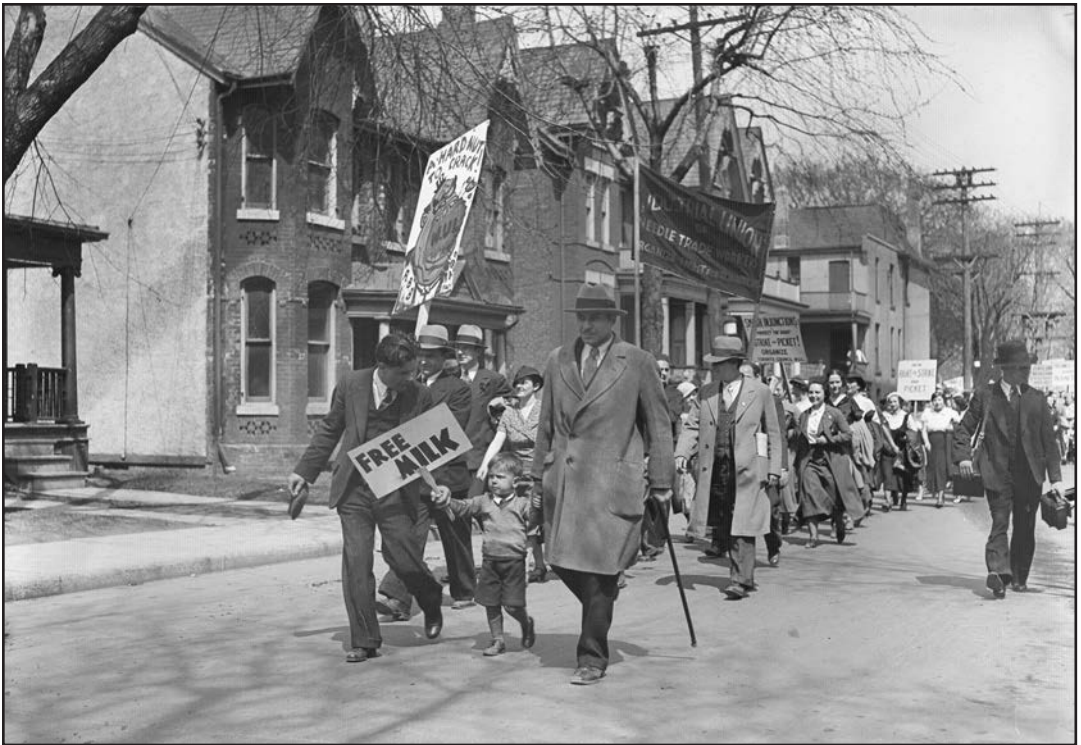
Men, women, and children marching for free milk in Toronto's 1934 May Day parade.

their children could, thus, be seen as an extension of traditional maternal femininity. These women were not challenging gender conventions, but rather asserting their roles as mothers and the primary purchasers in the household.