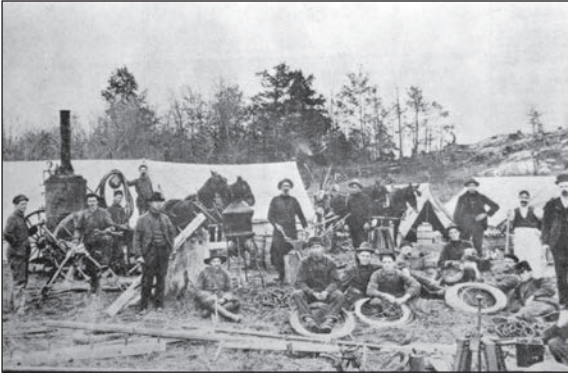
The construction of the line connecting Owen Sound to Meaford, 1886, 990.5.12

with their services were Woodford Telephone Co., Silcote Telephone Co. and Sydenham Union Telephone Co., all independent companies which like Centre Road Telephone Co. provided service to a set of residents considered too remote to be serviced by Bell. City lines had the luxury of being private lines, but, at the time, all rural telephone lines were party lines, with up to fifteen households sharing a single wire. For Centre Road Telephone Co. there were thirty-two shareholders in their company with seventeen shares each; each original shareholder guaranteed connection to the newly erected telephone lines. When these shares were sold, problems could arise if location of service changed with them, especially considering no money returned to the telephone company. In such cases, it was advisable to provide service at no cost to the new shareholder. The Supervisor of Telephone Systems, James McDonald, addressed Centre Road Telephone Co. on this concern: