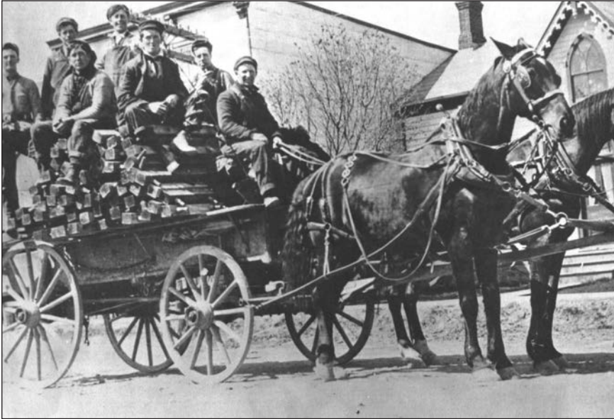
Linesman taking a wagon of crossarms to repair telephone lines. 989.21.3

related to the running of a rural telephone company. Financial records are the most prominent items in these fonds—stock records of shareholders, receipt and cash books, notices to creditors, tax information—but other textual documents also