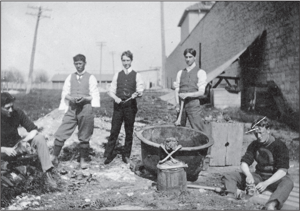
Assembling a Skeleton: Queen's University students prepare a skeleton off-campus. Notice the man on the far right has the Queen's 'Q' on his shirt. Date unknown.