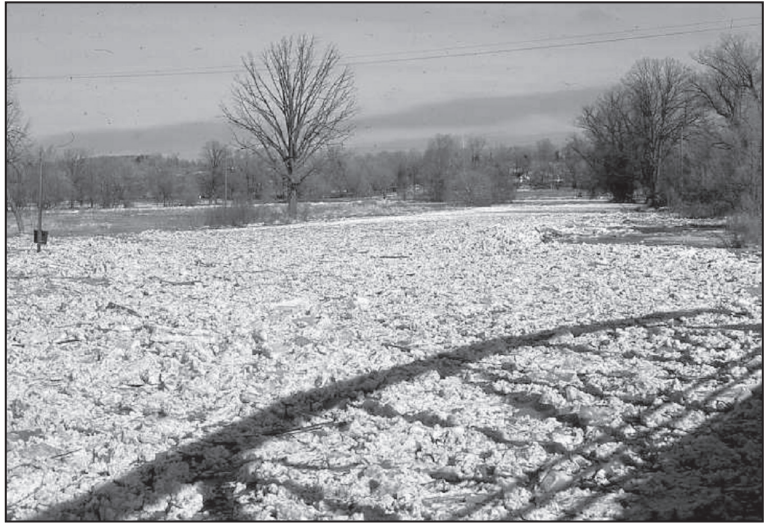
FIGURE 12. Meadowvale village is at its most rural-looking as one approaches from the west. An ice-jam in January 1973 dramatizes the role of the river and its flood-plain as recreational green space out of reach to suburban development.

one questionable limit was Second Line south from the community hall, along which extended that straggle of mainly builder-built houses on odd-sized lots severed from adjacent farms between the 1920s and the 1960s. Second Line south was an unplanned continuation of the incremental evolution of the older village, but was ignored by heritage interests. In 1980 it simply did not meet HCD expectations.