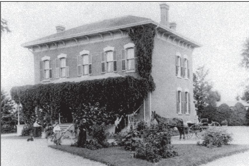
FIGURE 6. The Charles Gooderham Estate, about 1900. It is a private school in 2012.

Meadowvale picture in 1854, the year when the Silverthorn mill burned for a second time. He rebuilt again (a paternalistic response for which his work-