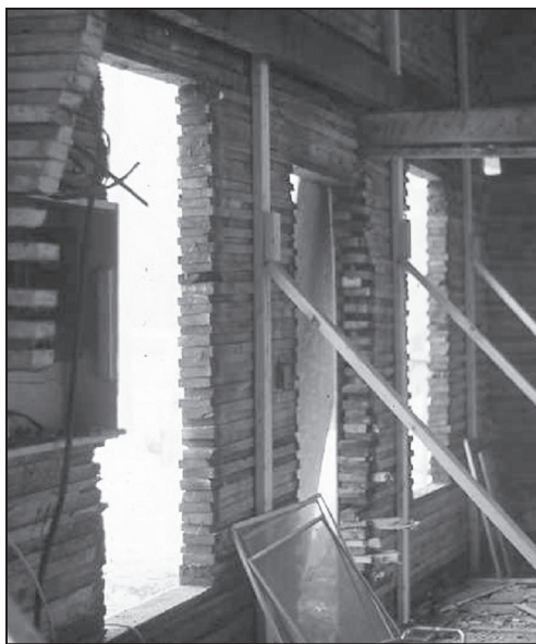
FIGURE 2. Short 'seconds' left over from the sawmill were nailed together in the plank-on-plank construction technique. Planks were offset in order to provide an uneven bonding surface for stucco and plaster. This is 7067 Pond Street during rebuilding in February 1985.

terpower streams in southern Ontario. 3 A sawmill and a grist mill were running later in 1845 with an unknown number of hands at work. The gristmill burned in 1849, Silverthorn rebuilt, and was back in full business in 1852. Later he added a barrel and stave factory and entered into flour milling. Wood from the sawmill was reportedly used in planking Hurontario Street in 1849, a labour-intensive activity to be sure. In 1853 the Johnson brothers started manufacturing farm machinery at their Mammoth Iron Works and Foundry. They employed twenty men at first, a