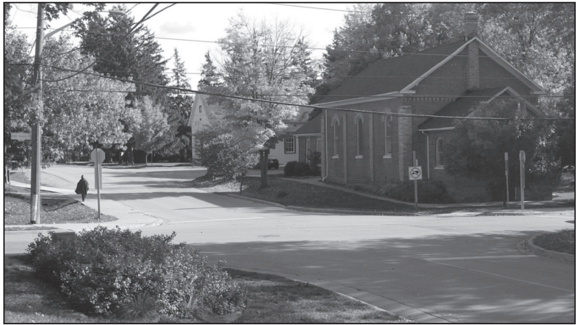
FIGURE 10. Looking southward along Second Line where it crosses Old Derry Road, in 2012. This might have been the intersection of two six-lane arterial roads. The 1863 Methodist Church stands on the southwest corner, with the 1871 village school (later, community hall) visible beyond.

routes to and from the rest of the city. Meadowvale has