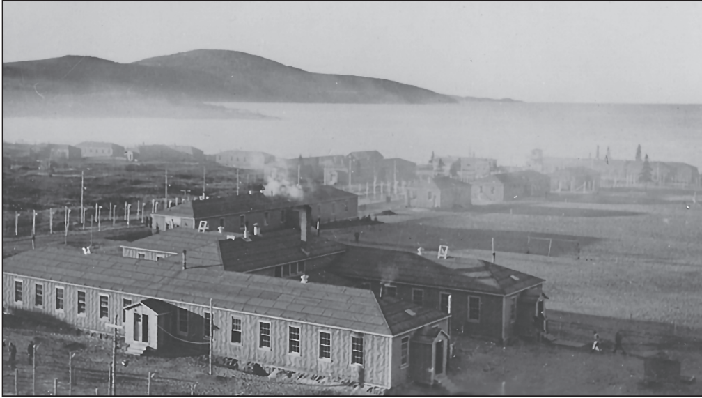
Taken from the guard post atop the water tower, this photo shows Camp 100 with the kitchen and mess hall in the foreground. Although this was taken in 1942, the camp would have appeared much the same in 1944. Note the soccer nets up in the sports field.