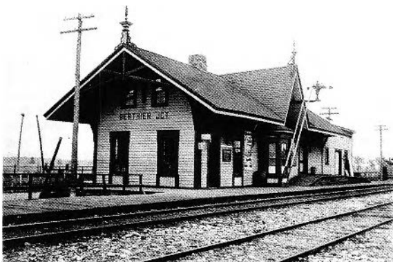
FIGURE 1. Canadian Pacific Railway Station, Berthier Junction, Quebec, ca. 1892.