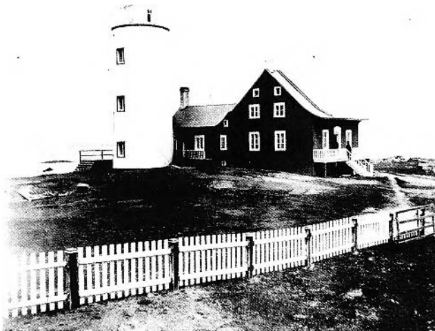
FIGURE 3. Lighthouse, Green Island, Quebec, 1809 (Photo: Public Archives of Canada).