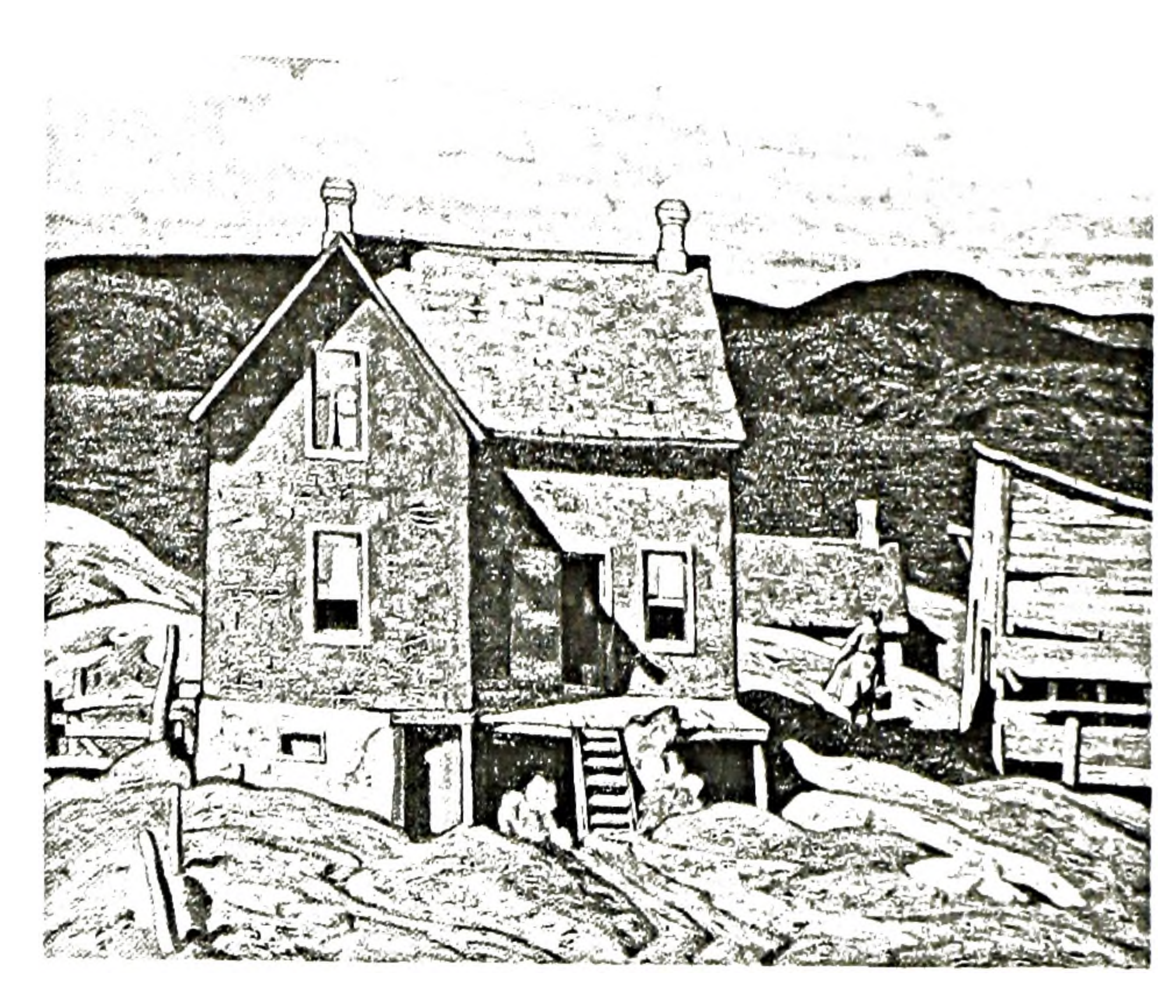
FIGURE 2. A.J. Casson, Old House, Parry Sound, 1932. Toronto, Roberts Gallery. Cat. no. 22.

the reader's perception of the artist and his environment to a considerable degree.