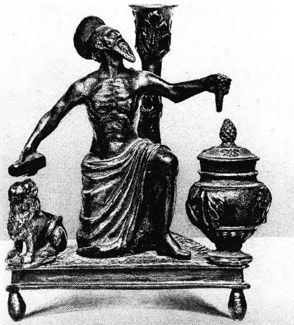
FIGURE 2. Bronze inkstand with statuette of St. Jerome; from Wilhelm Bode: Collection of J. Pierpont Morgan: Bronzes of the Renaissance and Subsequent Periods (Paris 1910), I, Pl. xxxiv.