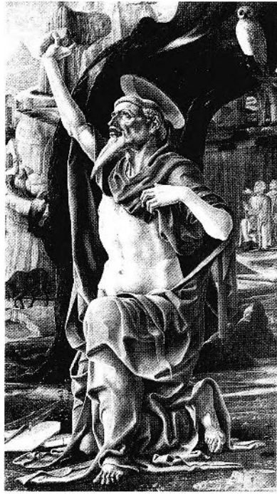
FIGURE 3. St. Jerome (Fragment), panel. Italian, Ferrarese, by Cosimo Tura; National Gallery, London, Inv. 773.

which is given to Cosimo Tura. 6 One also notices the expressional motif of the parted lips and, though different in particulars, there is a broad similarity in the tension of the musculature (Fig. 3) to suggest an intense psychological state. Some analogous features appear in an Ercole de Roberti panel also in the National Gallery, London 7 (Fig. 4), depicting a kneeling Jerome of the same general type as that of the statuette, although the head is tilted forward and not back and the arms, though spread, are less fully extended than in the bronze. Both these paintings and the statuette nonetheless conform to what may be interpreted as the same regional iconographic convention current in the late 15th and early 16th centuries throughout the Italian peninsula, particularly around Padua, Venice, Ravenna and Ferrara.