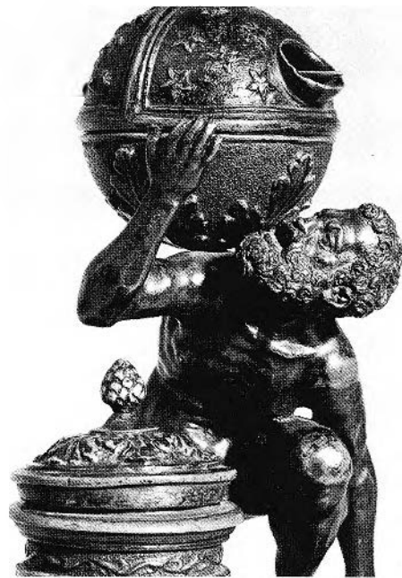
FIGURE 6. b) Atlas Supporting the Globe of Heaven (Detail of Figure 6 a).

R.O.M.'s figure is more comfortably accommodated among those bronzes which are now generally, though as yet by no means conclusively, grouped around Severo di Ravenna. It is possible of course that some works among them may be related to a distinguishable if anonymous workshop hand. It is interesting in this light to be aware of some similarities apparent between the St. Jerome and a group of Atlas figures supporting the globe of heaven, which, although considered to derive from a Riccio model, could equally well have been cast in another workshop. 16 The tension in the pectoralis major muscles of the Atlas figures, as well as the ridge-like stylisations of the latissimus dorsi muscles find an echo in the coarser musculature of the torso of the St. Jerome . The protruding eyeballs of the Atlas bronzes, the stylisation of anatomical features within the arms, hands, chest and back are all perhaps as close to bronzes now attributed to the Severo workshop as to Riccio's. This is seen in the details of the Frick Atlas (Fig. 6 a-b) whose stand, for example, has ornamental details of the same form and style as those associated with writing caskets, such as that in the Cleveland Museum of Art, now attributed to Severo. 17 What is equally important is that the lid of the urn on the base of the Frick piece is of the same type as that appearing with the Museo