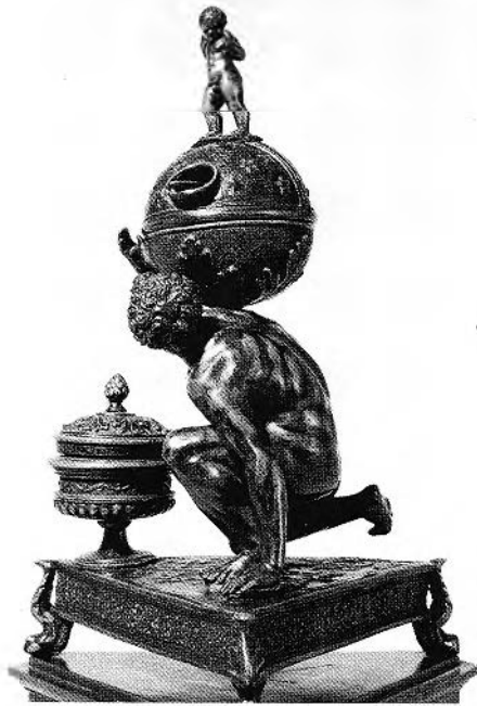
FIGURE 6. a) Atlas Supporting the Globe of Heaven, bronze, hollow cast, H. 34.6 cm. Normally attributed to the Workshop of Riccio, but possibly connected to the Workshop of Severo da Ravenna. The Frick Collection, New York, Inv. 15.2.24.

R.O.M.'s figure is more comfortably accommodated among those bronzes which are now generally, though as yet by no means conclusively, grouped around Severo di Ravenna. It is possible of course that some works among them may be related to a distinguishable if anonymous workshop hand. It is interesting in this light to be aware of some similarities apparent between the St. Jerome and a group of Atlas figures supporting the globe of heaven, which, although considered to derive from a Riccio model, could equally well have been cast in another workshop. 16 The tension in the pectoralis major muscles of the Atlas figures, as well as the ridge-like stylisations of the latissimus dorsi muscles find an echo in the coarser musculature of the torso of the St. Jerome . The protruding eyeballs of the Atlas bronzes, the stylisation of anatomical features within the arms, hands, chest and back are all perhaps as close to bronzes now attributed to the Severo workshop as to Riccio's. This is seen in the details of the Frick Atlas (Fig. 6 a-b) whose stand, for example, has ornamental details of the same form and style as those associated with writing caskets, such as that in the Cleveland Museum of Art, now attributed to Severo. 17 What is equally important is that the lid of the urn on the base of the Frick piece is of the same type as that appearing with the Museo