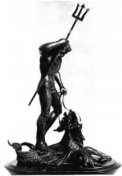
FIGURE 5. Neptune on a Sea Monster, bronze, hollow cast, H. to top of figure 33.9 cm. Italian, early 16th century, by Severo da Ravenna, The Frick Collection, New York, Inv. 16.2.12.

The Toronto bronze also seems to have some characteristics, such as the simplified modelling of the limbs, common to the numerous Neptune figures attributed to Severo di Ravenna. The best among these is that from the Frick Collection in New York (Fig. 5). 11 Its boneless forearms and smooth untextured hands appear in an even more summary manner in the St. Jerome and in the workshop Neptunes such as the one from the Museo Nazionale, Florence, referred to in a recent article by Bertrand Jestaz. 12 There are some further points of comparison between the St. Jerome and a bronze St. Christopher in the Louvre which Jestaz attributed to Severo in the same article. These are most evident in the treatment of details of hair and beard, the modelling of limbs and, to a certain degree, the drapery styles. Such generic similarities are normal to the style of a given workshop, but when individual bronzes are examined in terms of the specifics of their modelling and casting, one sees slight differences and variations which may indicate different