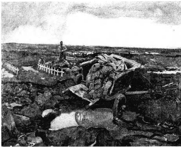
FIGURE 1. F. H. Varley, For What?, 1918. Oil on canvas, 147.3 × 183 cm. Ottawa, Canadian War Museum.