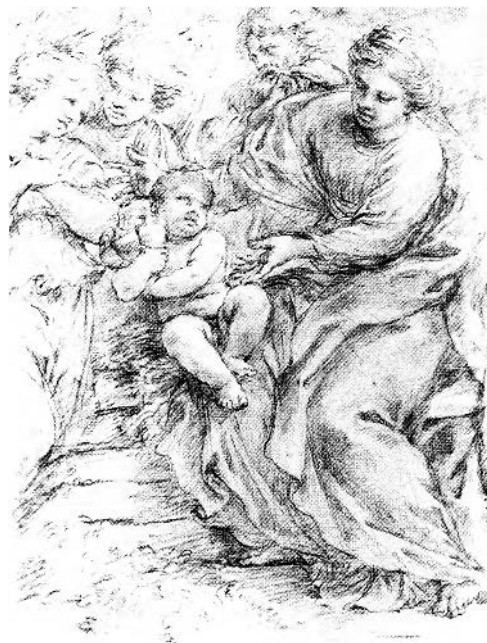
FIGURE 1. Alessandro Algardi, The Holy Family and Two Angels , black chalk, 260 × 200 mm. Montreal, private collection (Photo: Owner).