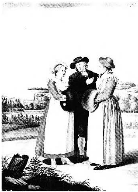
FIGURE 1. William Berczy, Three Standing Figures in a Landscape near Florence , 1781-82. Watercolour, pen and black ink, 42.4 × 31.1 cm, National Gallery of Canada, Ottawa, No. 16559.