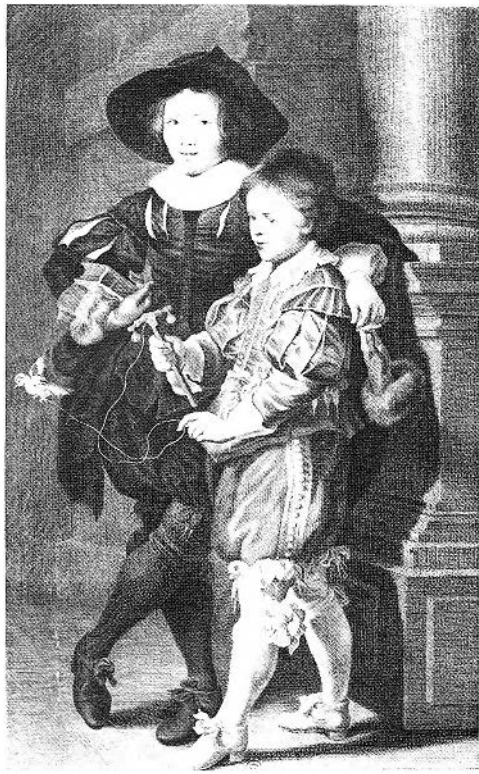
FIGURE 7. Gustav Adolph Müller after Rubens, Albert and Nicolas Rubens . Etching and engraving, 42.2 × 26 cm.

shaded and further varied by the effect of light and shadow. The little girl wears a long white dress of a silky texture, trimmed at the neck-line and the hem with light blue. A wide sash of the same colour is wrapped twice around her waist and tied in a bow. She wears an elaborate head-dress, also blue, decorated with flowers and black and white feathers. Ludwig is dressed in a suit of rich brown, trimmed with green, and a black hat with white feathers. Karl wears a suit of yellow trimmed with pale blue and a sash of the same colour. Both boys wear white blouses with wide decorative collars.