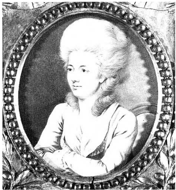
FIGURE 9. William Berczy, Marianne von Muralt 1783. Gouache, 13.2 × 11.2 cm. Berne, Private Collection

coiffure fills the upper half of the picture, just as the folded arms fill the lower. The background is considerably lighter. She looks thoughtfully not at the viewer but into the distance. The two von Muralt ladies are painted with great elegance and delicacy and can be numbered among the best works that have so far been identified as being by Berczy.