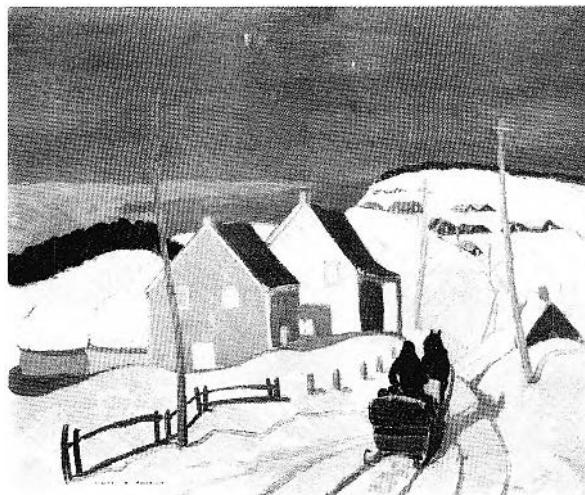
FIGURE 6. Albert H. Robinson, Moonlight, Saint-Tite des Caps , 1941, cat. 46. Ottawa, National Gallery of Canada.