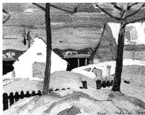
FIGURE 4. Albert H. Robinson, oil sketch for Cacouna , 1921, cat. 5.