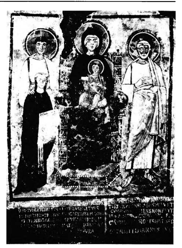
FIGURE 1. Tomb of Turtura, Catacomb of Commodilla, Rome (Photo: Pontificia Commissione di Archeologia Sacra).

Shortly after the burial of Turtura in the Catacomb of Commodilla, the suburban catacombs ceased to be used for their original purpose as places of burial. This shift from cemeteries outside the city to cemeteries within the perimeter of the Aurelian walls was complete by the second half of the 6th century,