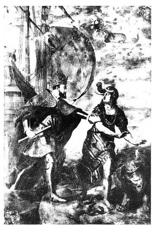
FIGURE 5. Gaspar de Crayer, Charles v Conquers Africa. 1635. Panel, 459 \times 304 cm. Ghent, Museum van Bijloke (Photo: Claerhout).

23 For the similar sentiments addressed by Jacob Edelheer of Antwerp to the Archduke Ferdinand at the time of the latter's entry into that city in 1635, see Martin, 215-216: 'And he concluded in unavoidably threadbare phrases, by declaring that public prayers had been offered "for the health and safety of Your Screne Highness, so that this city,