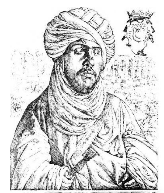
AWLEI AEAET PRINCEPS AFRICANVS HLIVS REGIS TVASI FIGURE 4. Jan Cornelisz Vermeyen, Mulay Ahmad, ca. 1536. Etching, 495 × 377 mm. Amsterdam, Rijksprentenkabinet.

allowed him to escape. Charles then restored to his throne Mulay Hasan, a notoriously cruel and corrupt ruler as well as an Infidel. Furthermore, Hasan's period of renewed tenure as vassal of Charles v was shortlived, for in 1542 his equally cruel son Mulay Ahmad blinded and deposed him.<sup>13</sup>