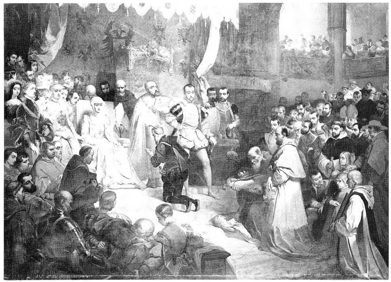
FIGURE 2. Louis Gallait, The Abdication of the Emperor Charles v. 1842. Canvas, 121 × 170 cm. Frankfort on the Main, Städelsches Kunstinstitut.

of exotic objects and animals. The armadillo, for instance, is native only to South America. The three crowned women in the right background hold banners with the arms of the seventeen provinces of the northern and southern Netherlands, and of Charles' Spanish and Italian possessions.