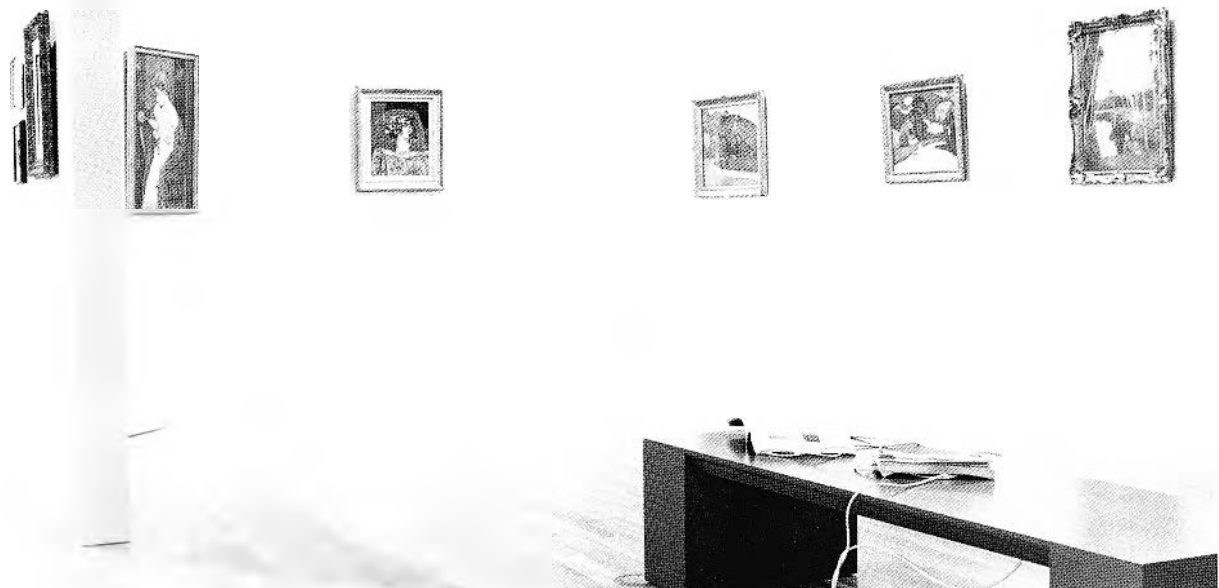
FIGURE 1. Installation view of James Wilson Morrice 1865-1924, Montreal Museum of Fine Arts. Left to right: Nude with a Feather (cat. 71), Flowers (cat. 73), Landscape, Trinidad (cat. 104), Landscape, Trinidad (cat. 103) and The Pond, West Indies (cat. 106).

temporary photographs of cities in which the artist painted, and photographs of early exhibitions in which Morrice exhibited (duplicating the illustrations in the catalogue). The exhibition was hung chronologically, the works in the second gallery covering the first period of Morrice's career, up to about 1900, the large gallery works to about 1909, and the last gallery the remaining works. The watercolours (matted and unframed) and sketchbooks were displayed in cases with rubber 'blinds,' which the public could lift, to protect the works on paper from light. While this caused a certain frustration and incomprehension on the part of the public, it was a suitable solution to enable these works to be included in all the five venues of the exhibition's tour. Cloth covers would have been a more compatible material than the high-tech rubber. The paintings were sparsely hung on pale, peach coloured walls, so that on entering the visitor was first conscious of a mass of discordant frames, only secondarily seeing the paintings. The superb long view from the top of the grand staircase to the long gallery gave on to The Old Holton House (cat. 62), far too similar in tonality to the peach wall and which weakly bled into the background. While this painting has a clear historical relationship to the Montreal Museum, being a depiction of the present museum's original site, it is not one of Morrice's strongest works.