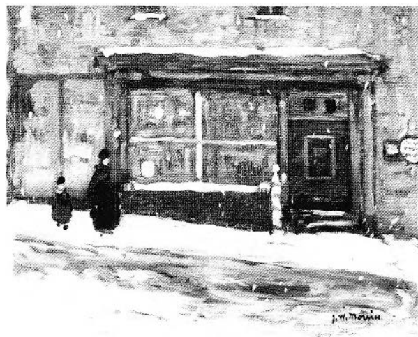
FIGURE 2. J.W. Morrice, The Barber shop , ca. 1905. Oil on canvas, private collection, Montreal.

Of the numerous canvases of the quays along the Seine there are only three examples (including the two from the Musée d'Orsay, Paris), yet this subject remained a constant fascination for Morrice throughout his career, and his treatment of it up to, and including, the loosely brushed bookstalls possibly painted after the First World War (Fig. 3) would have given us the occa-