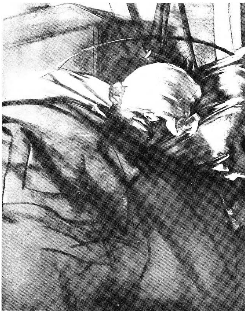
FIGURE 5. Eric Kennington, Mustard Gas , pastel (Photo: Canadian War Museum).

troops were engaged in a peripheral campaign against Bolshevism, were cancelled. Preliminary sketches for major works were not acquired, then or in the 1940s when many were offered once more. A gallery to house the collection got no further than a roughly sketched proposal; by contrast, Australia was reasonably prompt in finding a suitable home for its more modest assemblage of art and military trophies.