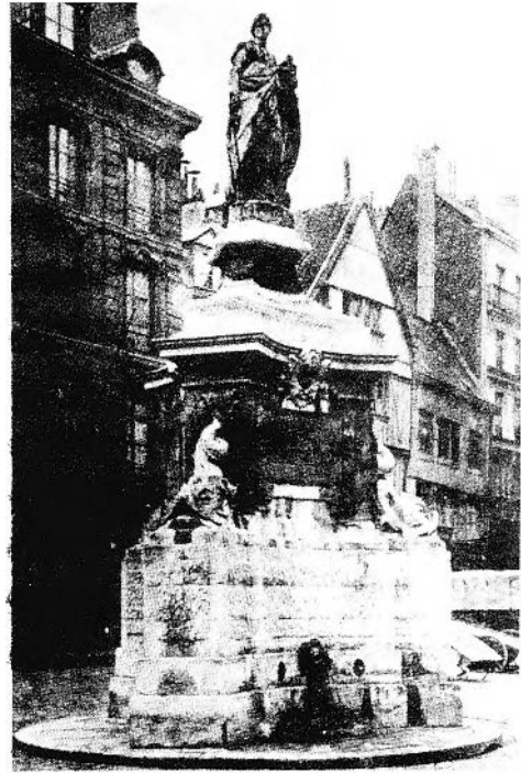
FIGURE 76. Paul-Ambroise Slodtz, Joan of Arc as Bellona , Rouen, 1755-57 (destroyed 1944).