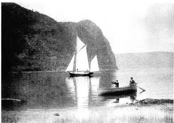
FIGURE 90. Yacht in Full Sail, in Eternity Bay, P.Q. National Photography Collection, Public Archives of Canada, PA-8716.