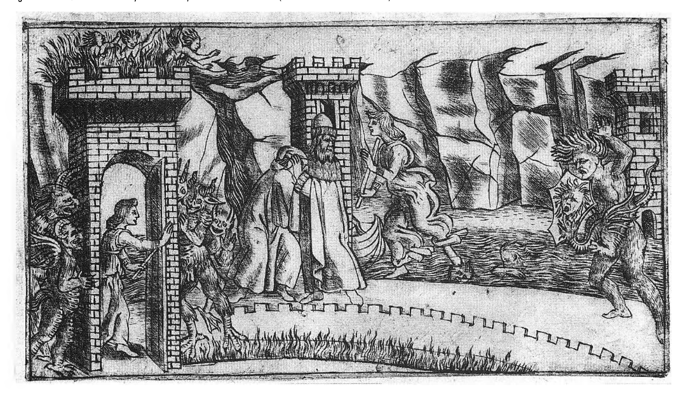
Figure 4. Inferno, Canto IX: The Styx and the City of Dis. 9.7 x 17.5 cm..

were stamped into the format of the book and the very letters of the poem.