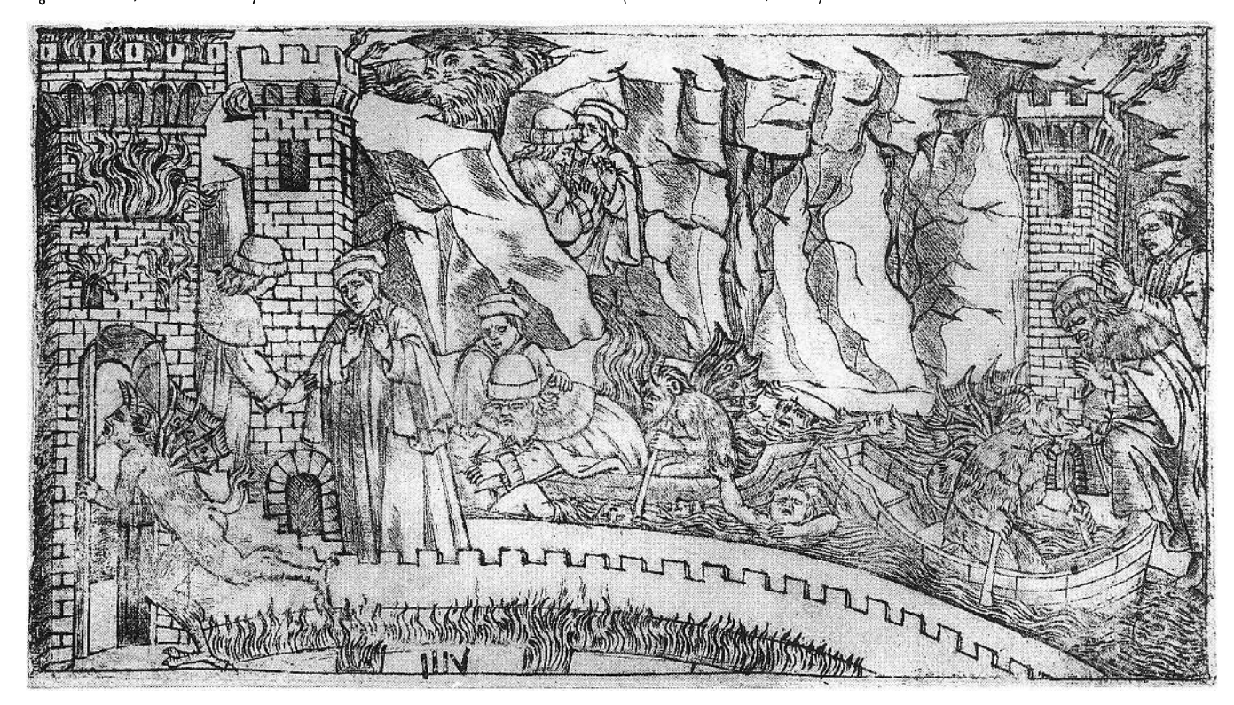
Figure 3. Inferno, Canto VIII: The Styx and the Punishments of the Wrathful. 9.6 x 17.6 cm. (Photo: British Museum, London).

that he felt it necessary to liberate "el nostro cittadino" from the barbarisms of non-Tuscan commentators and, through his efforts, to bring Dante's exile to an end. About Tuscan, Landino adds: