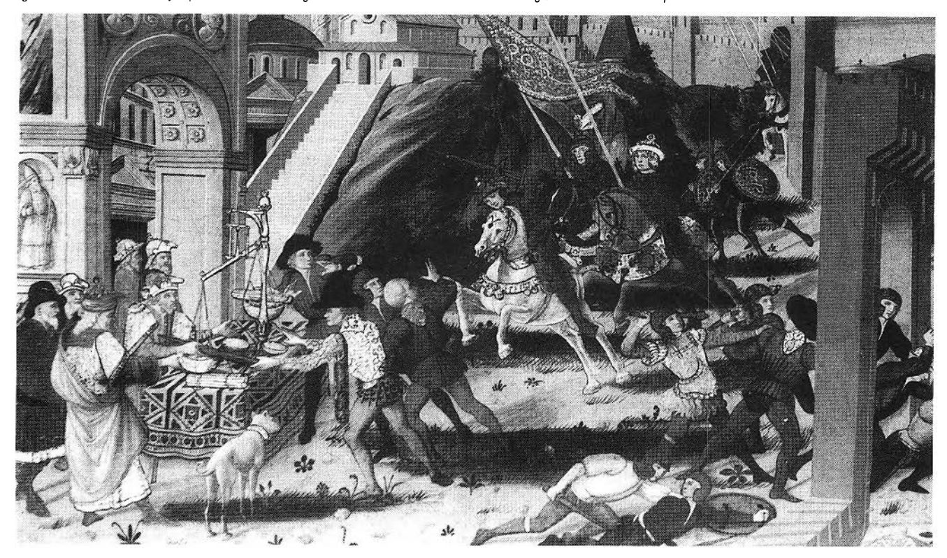
Figure 5. Zanobi di Domenico, Jacopo del Sellaio, and Biagio d'Antonio. The Morelli Cassone, central image, "The Gauls Defeated by Marcus Furius Camillus". 1472.

These illustrations must be considered another example of Florentine bravura, another attempt to outdistance technically all previous editions. But with their inclusion came a new complication, the necessity to position them in relation to the many visual representations of Dante and the Comedy which existed in the public sphere. Dante's history in Florence was not only oral and aural, it was also visual: frescoes based more or less exactly on the Inferno covered the walls of many churches, including the Strozzi Chapel in Santa Maria Novella. Even a more distant image like the fresco in the Pisa Camposanto was known through a variety of Florentine prints which circulated in the 1460s and 70s. <sup>41</sup> Obviously, if the poet and poem were to be distinguished from the culture of the masses, the illustrations could not be allowed to recall widely accessible images.