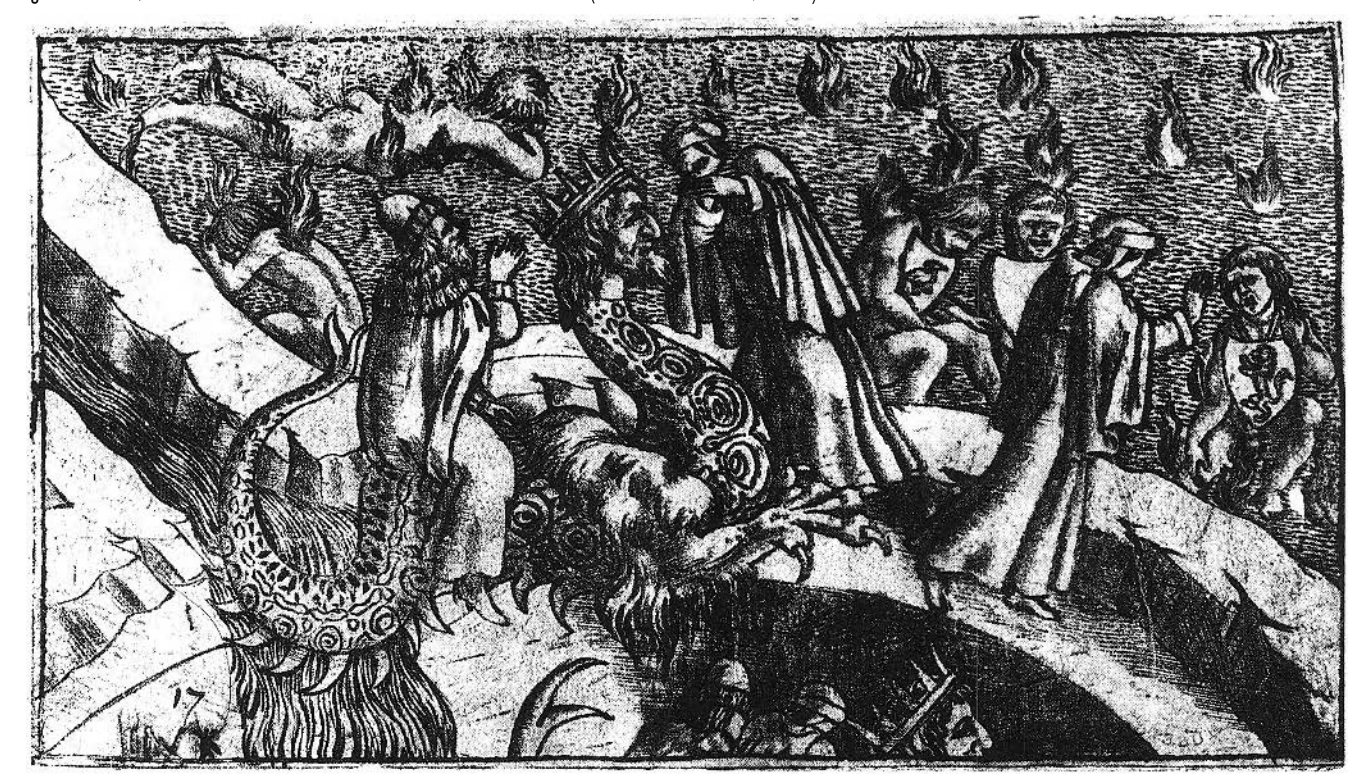
Figure 6. Inferno, Canto XVII: The Punishments of the Usurers. 9.7 x 17.5 cm.