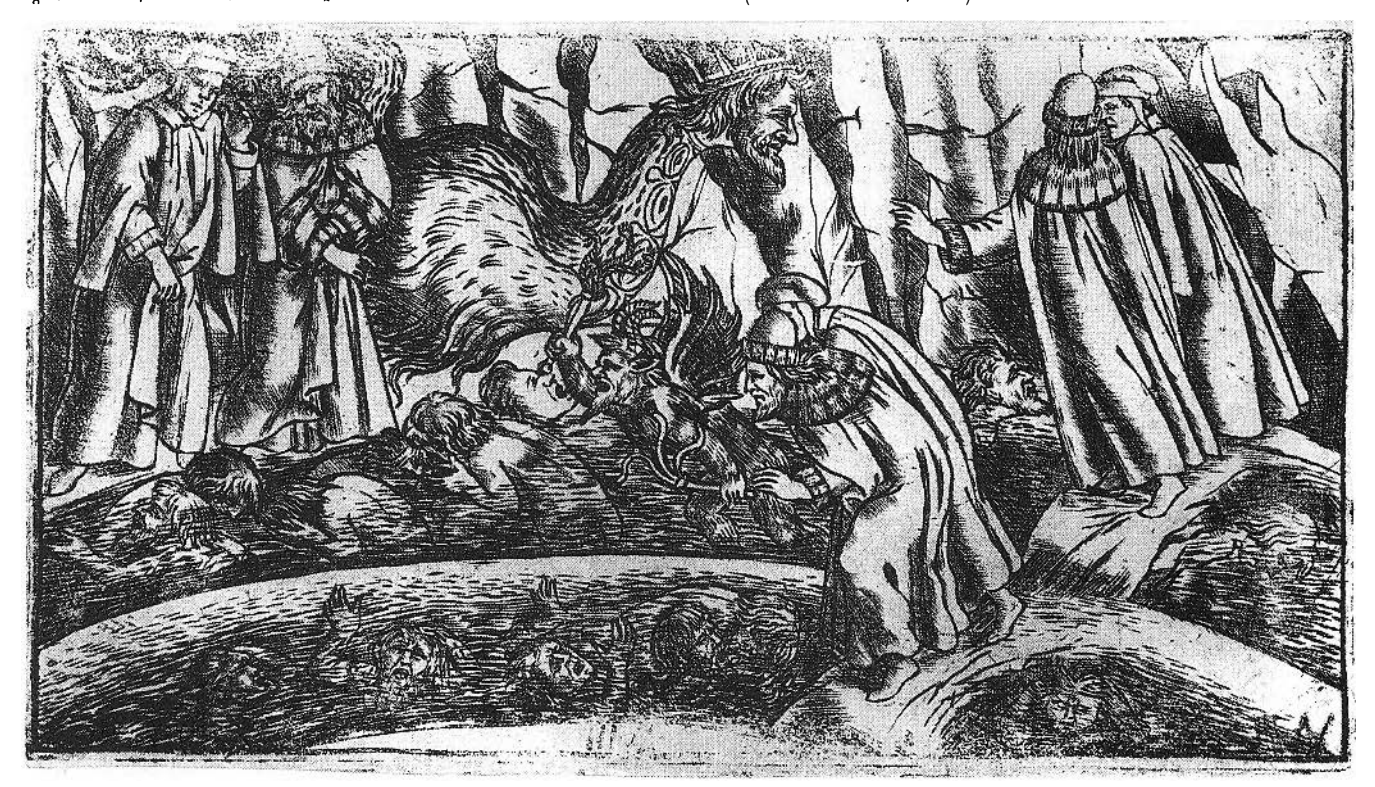
Figure 7. Inferno, Canto XVIII: The Malebolge with the Panderers and the Flatterers. 9.6 x 17.6 cm. (Photo: British Museum, London).