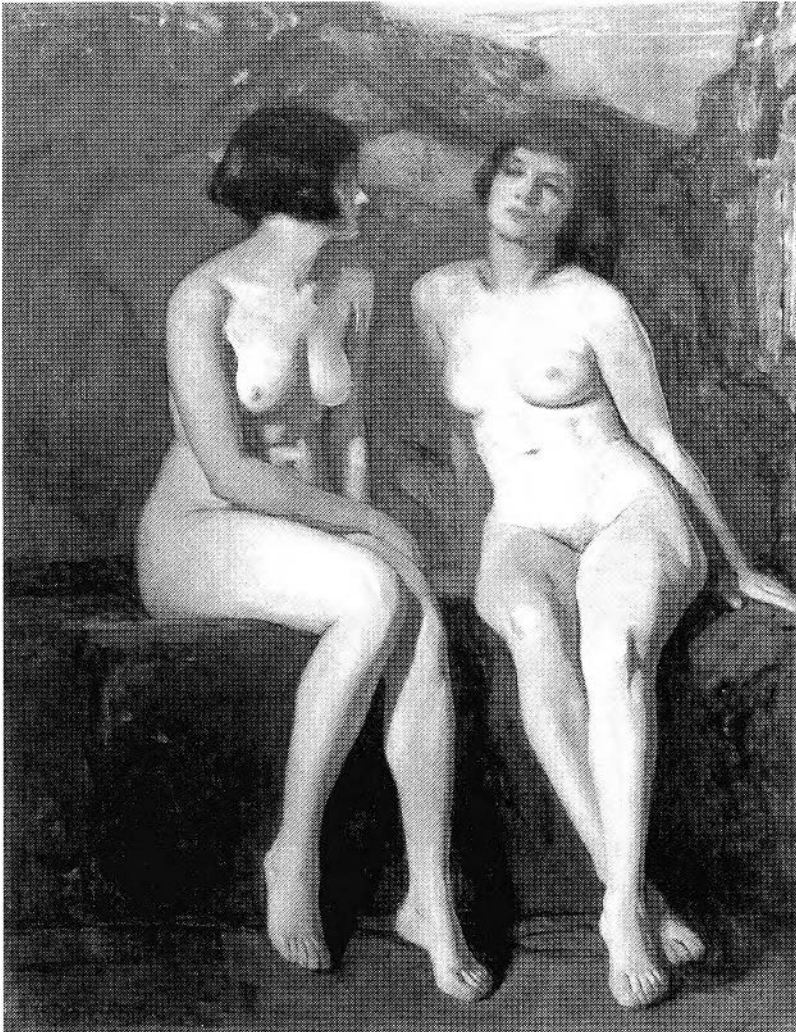
Figure 7. Regina Seiden, Nudes , ca. 1925. Oil on canvas, 117.4 x 91.5 cm. Ottawa, National Gallery of Canada. Purchased, 1926 (Photo: National Gallery of Canada).

perhaps viewers regarded Nudes as merely an academic exercise. It is also possible that the Art Gallery of Toronto, which banished the paintings by Newton and Holgate, had more timid trustees and a more puritanical public than the National Gallery.