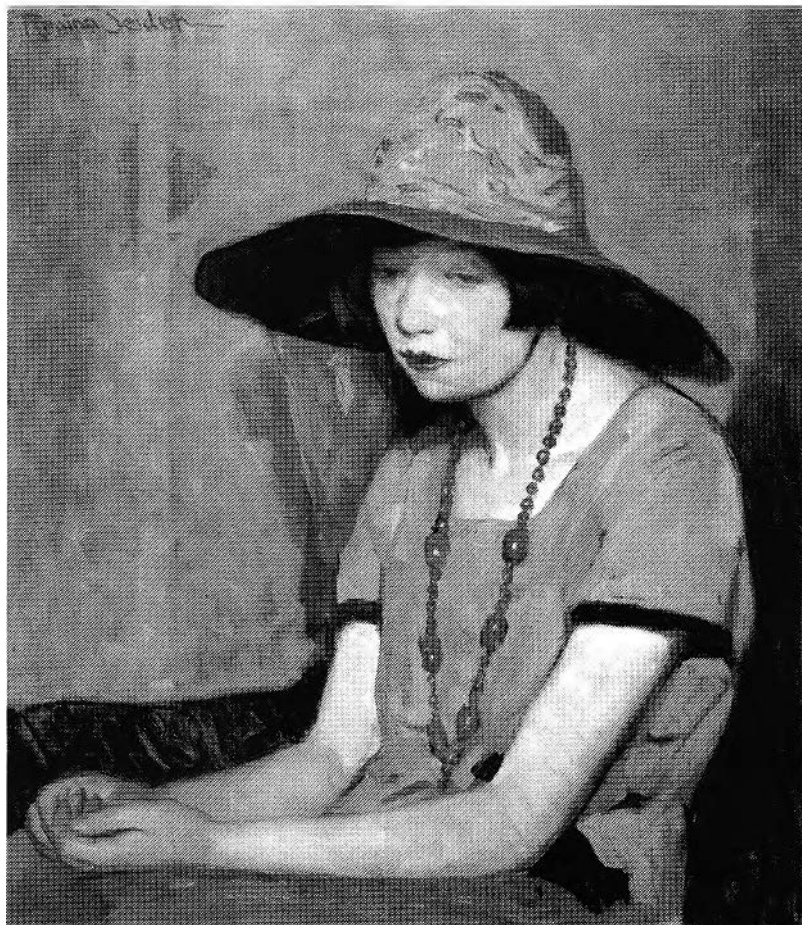
Figure 4. Regina Seiden, Dora , 1923. Oil on canvas, 76.5 x 66.5 cm. Ottawa, National Gallery of Canada. Purchased, 1924 (Photo: National Gallery of Canada).

The girl in Seiden's painting is probably the farmer's daughter, or other relative, since Quebec farmers counted on the unpaid labour of their families in the home and fields. 35