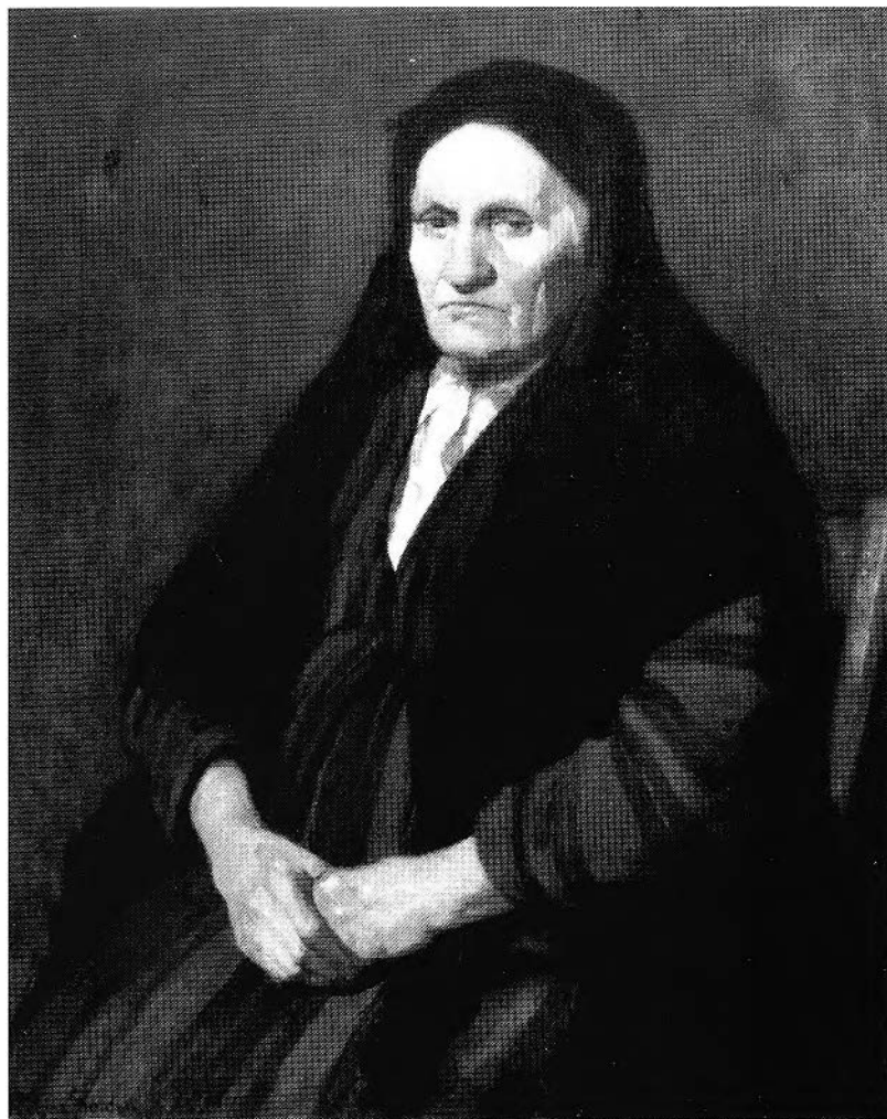
Figure 3. Regina Seiden, Old Immigrant Woman , 1922. Oil on canvas, 91.4 x 71.1 cm. Hamilton, Art Gallery of Hamilton. Presented in tribute to Mr. and Mrs. Goldblatt by their children, 1961.

grant, since Jews only began arriving in Montreal in significant numbers at the turn of the century. 27