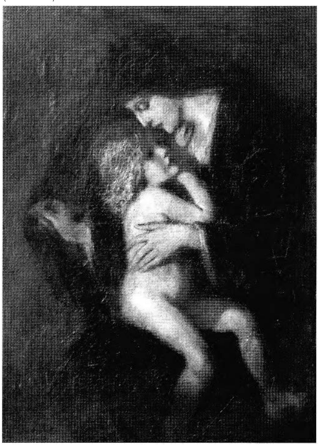
Eugenics, Social Purity and the Domestic Madonna

At the end of the nineteenth century in Canada,<sup>5</sup> as in America and Europe, painters were exploring the theme of motherhood, which functioned as a discursive site in which issues of morality, feminism, nationalism and religion entered the public debate. Late nineteenth-century representations of the maternal relied in particular on constructions of femininity which intertwined notions of the secular and the sacred. The earlier nineteenthcentury concept of "separate spheres," formulated in England but current in the colonies as well, assigned to the middle-class woman a special role as a secular Virgin Mary, a domestic Madonna. But it was made clear that women's purity was not innate and could only be guaranteed if they remained, like Coventry Patmore's angel, in the house. The social problems which accompanied rapid urbanization driven by industrialization threatened to disrupt the private, conservative, middleclass way of life, and women were called upon to become the moral conscience of society. It seemed only natural to most nineteenth-century Canadians that, while men competed in the