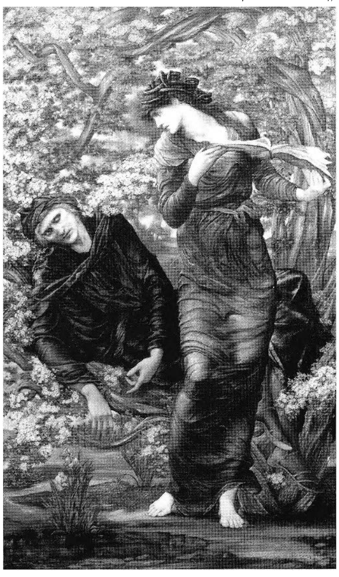
Figure 4. Edward Burne-Jones, The Beguiling of Merlin, 1874, oil on canvas.

loss would have been reason enough for her contemplation of the connections between women, children and death.