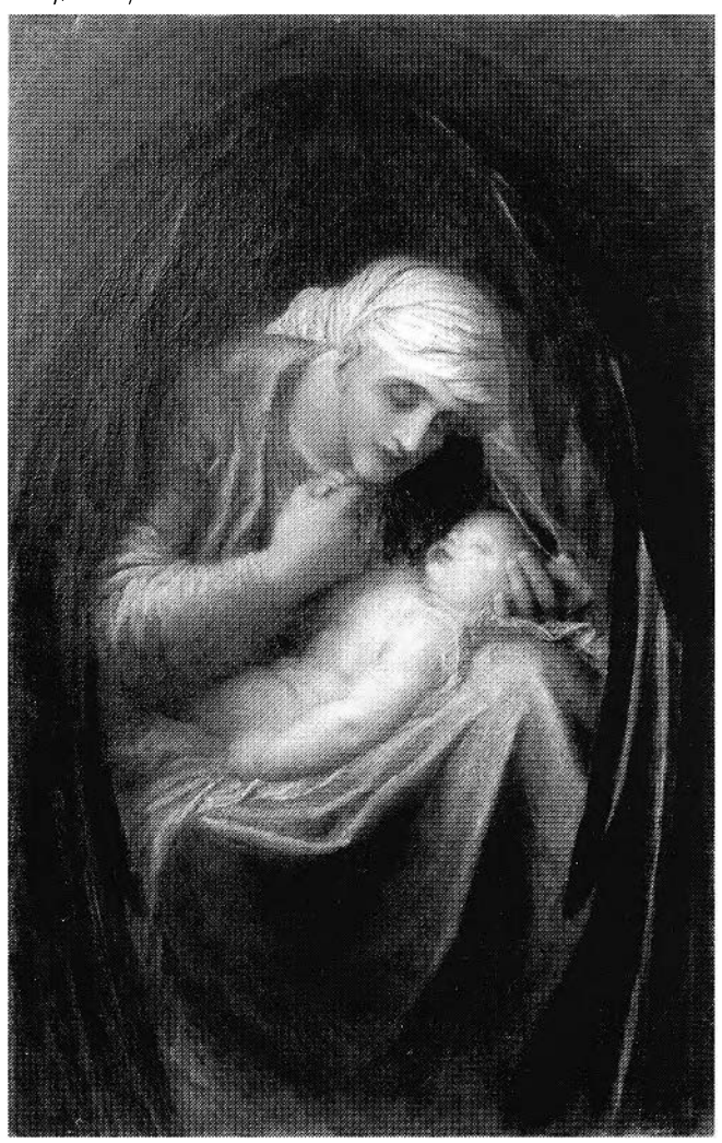
Figure 2. George F. Watts, Death Crowning Innocence, ca. 1885, oil on canvas.