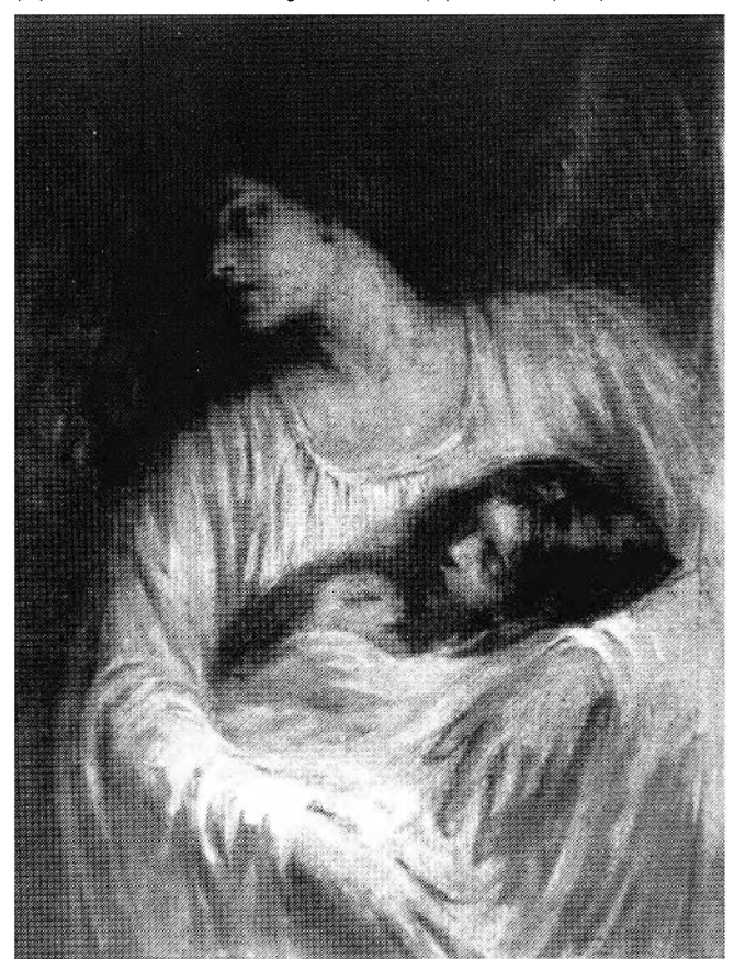
Figure 5. Laura Muntz, Protection, before 1911, watercolour on paper. Location unknown (Reproduced from The Canadian Magazine, XXXVII, 5 (September 1911), 426).

tural model of protection, it also contains the potential for destruction.<sup>40</sup> In Madonna and Child the mother is also the personification of death and, as such, can be seen as the Symbolist vampiric femme fatale.