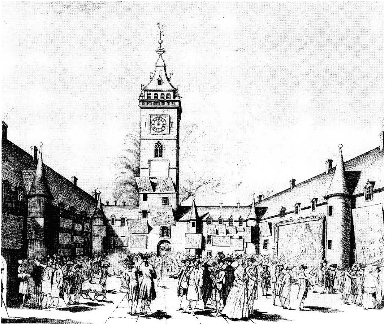
Figure 5. David Allan, Exhibition of Pictures in the Inner Court of Glasgow University, 1761 . Engraving. The Mitchell Library, Glasgow.

the 600-odd books published by the Foulis Press included editions of just two art-theoretical texts: Charles Coypel, Dialogue sur la Connoissance de la Peinture (1753–54); and Charles-Alphonse Dufresnoy, A Judgment on the Works of the Principal and Best Painters of the Last Two Ages (1755). 48