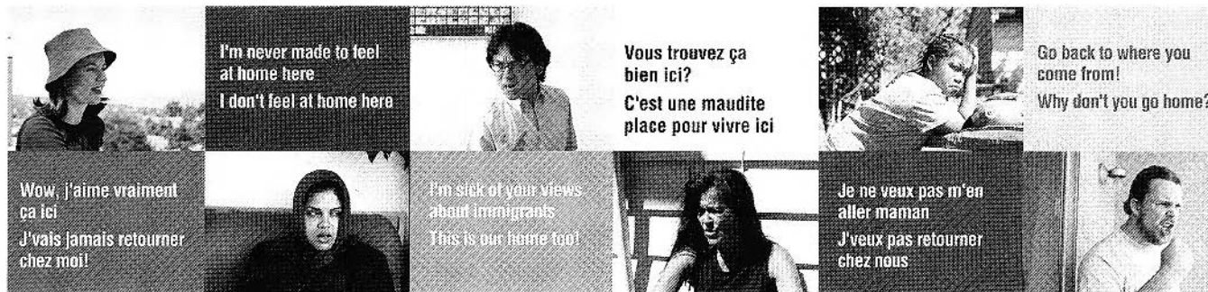
Figure 1. Ken Lum, There Is No Place Like Home , 2000. Acrylic lacquer on vinyl, 4.39 × 20.42 m (approx). Ottawa, Canadian Museum of Contemporary Photography; Collection of the artist, Vancouver; and Museum-in-Progress, Vienna (Photo: Ottawa, Canadian Museum of Contemporary Photography and National Gallery of Canada).

against up-beat, flat colours such as orange, green, etc.). The materials used in this work similarly borrow from established advertising conventions for the construction of billboards: indeed, the billboard's printed vinyl sheet 2 is affixed to the gallery's exterior wall at a height appropriate for mass legibility.