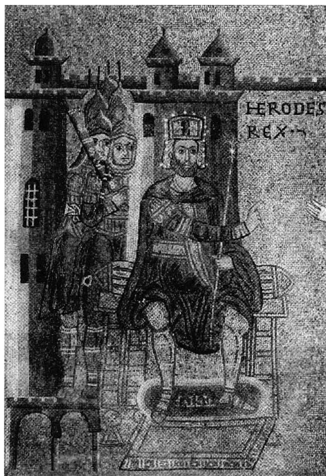
Figure 1a, 1b. Arrest of Saint Peter, north choir chapel, Church of San Marco, Venice (Photos: Osvaldo Böhm).