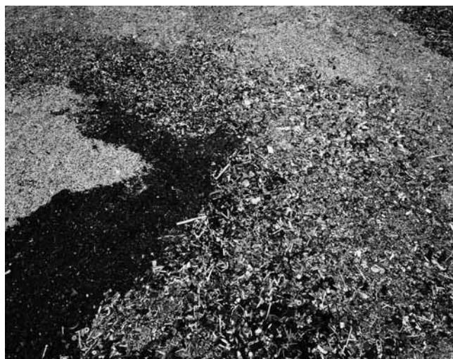
Figure 3. Edward Burtynsky, China Recycling #8, Plastic Toy Parts , Guiyu, Guangdong Province, China, 2004. Chromogenic colour print.

In many ways, Joseph Mallord William Turner's paintings epitomize the scenario of the Burkean sublime, in which nature is a malevolent atmosphere that threatens to obscure sight and overwhelm thought. In Snow Storm: Steamboat off a Harbour's Mouth (1842, fig. 2), for example, ocean, cloud, and sleet combine in a swirling tidal wave to descend on a barely discernable ship, located in the eye of the storm at the centre of the canvas. Similar in composition, Burtynsky's China Recycling #8, Plastic Toy Parts (2004, fig. 3) depicts curvilinear bands of colour that rear into an array of sky blue, muddy black, and gray punctuated with bursts of red, pink, and yellow. Fluid as this vortex of colour appears, it is not a rancorous tempest but a heap of trash: