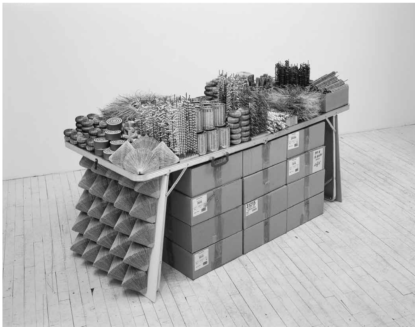
Figure 1. Jérôme Fortin, New York, New York , 1996–2005. Mixed media. Collection of the artist.

are actually made from strips of cut plastic bottles, a jarringly permanent material.