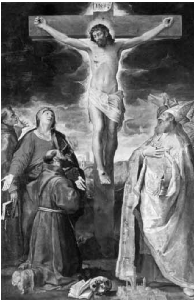
Figure 1. Annibale Carracci, Crucifixion with Saints , 1583. Panel, 305 x 210 cm. Bologna, Sta. Maria della Carità (Soprintendenza per i beni artistici e storici per le province di Bologna, Ferrara, Forlì, Ravenna e Rimini).

in the Counter-Reformation. In the context of the Oratorian-led interest in the archaeological remains of the early Apostolic Church, a new sense of continuity as a testimony to the legitimacy of the Roman Church superseded the Renaissance preoccupation with reconstructing venerable image traditions. Saint Filippo Neri's interest in the Roman catacombs opened a whole new area of ecclesiastical studies, which has subsequently come to be known as Christian archeology; and the methodology of Cardinal Cesare Baronio's Annales Ecclesiastici (1588–1607), in its close attention to chronology and obsessive concern with demonstrating the continuity of the Roman Catholic Church with the early Apostolic Church, was an orchestrated attempt to create a new ecclesiastical historiography. 6 Such ability to match past examples to contemporary imperatives found new urgency and definition in the Counter-Reformation. All these factors