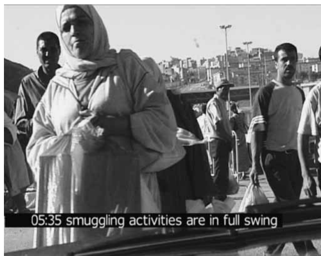
Figure 9. Ursula Biemann and Angela Sanders, Europlex , 2003. Video still, 20 min. (artwork © Ursula Biemann).

We prefer to think of buildings as solid, of home as a place of safety, of ourselves as separate from our neighbours, and of our bodies as made of living flesh not inorganic atoms. A traumatic event demonstrates how untenable, or how insecure, these distinctions and these assumptions are. It calls for nothing more or less than the recognition of the radical relationality of existence. 66