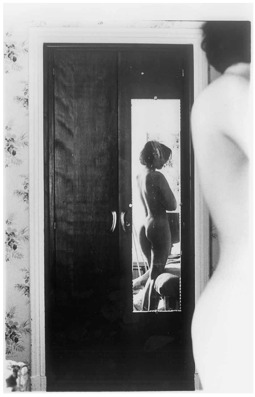
Figure 2. Alix Cléo Roubaud, La Bourboule, chambre 14 (Photo courtesy Jacques Roubaud and Éditions du Seuil).