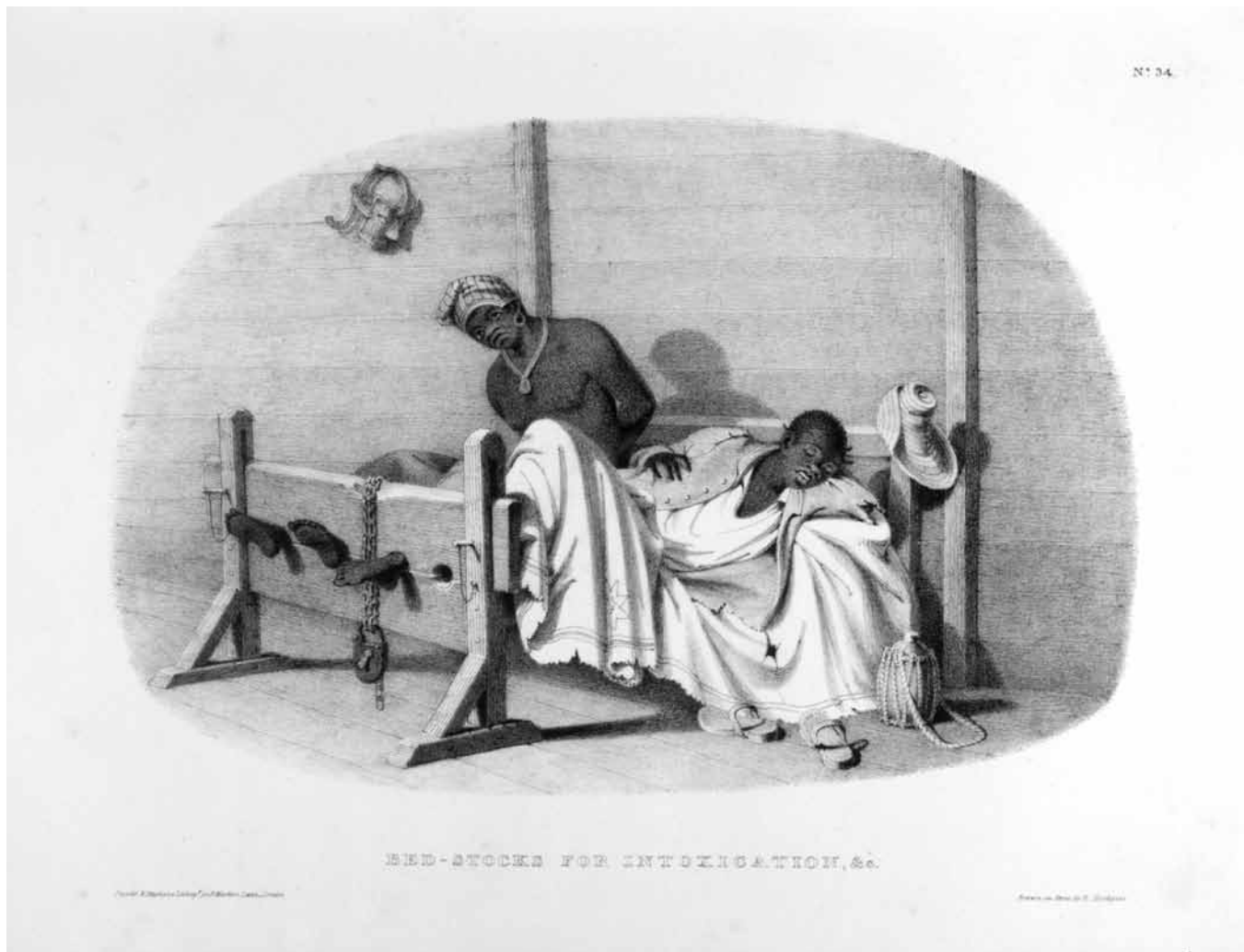
Figure 1. Richard Bridgens and A. Ducôte, Bed-Stocks for Intoxication , from West India Scenery, with Illustrations of Negro Character, the Process of Making Sugar, etc. from Sketches taken during a Voyage to, and Residence of Seven Years in, the Island of Trinidad , 1836. Lithograph, Yale Center for British Art, New Haven, Conn. (Photo: courtesy the Yale Center for British Art).

This statement is particularly relevant for the visual culture of slavery, as there was constant anxiety among white slaveholders about slave uprisings, and representations of slaves by white artists must be considered in light of this fact.