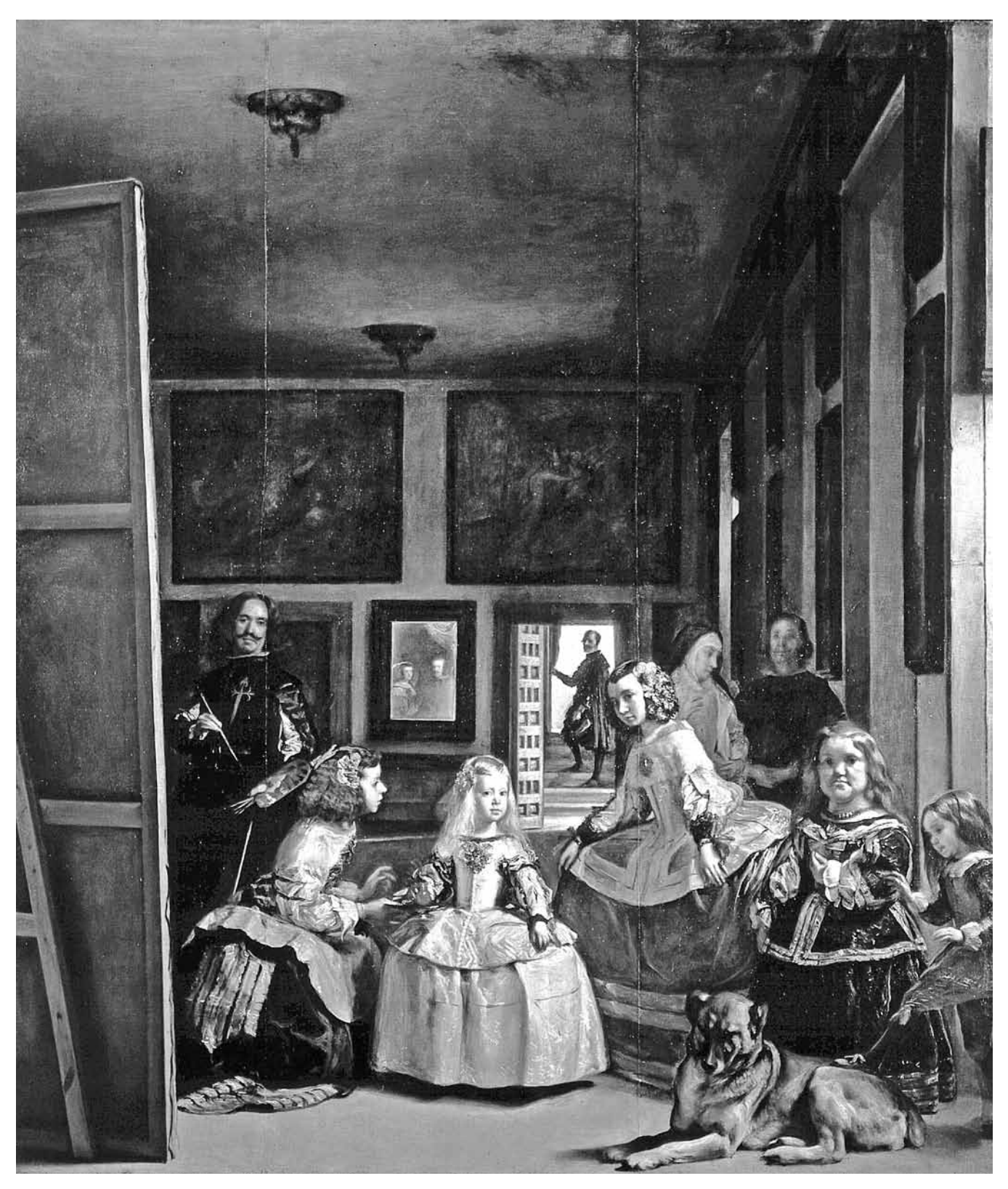
Figure 2. Diego Velázquez, Las Meninas, 1656. Oil on canvas, 318 \times 276 cm. Madrid, Museo del Prado (Photo: Gianni degli Orti / The Art Archive at Art Resource, NY).