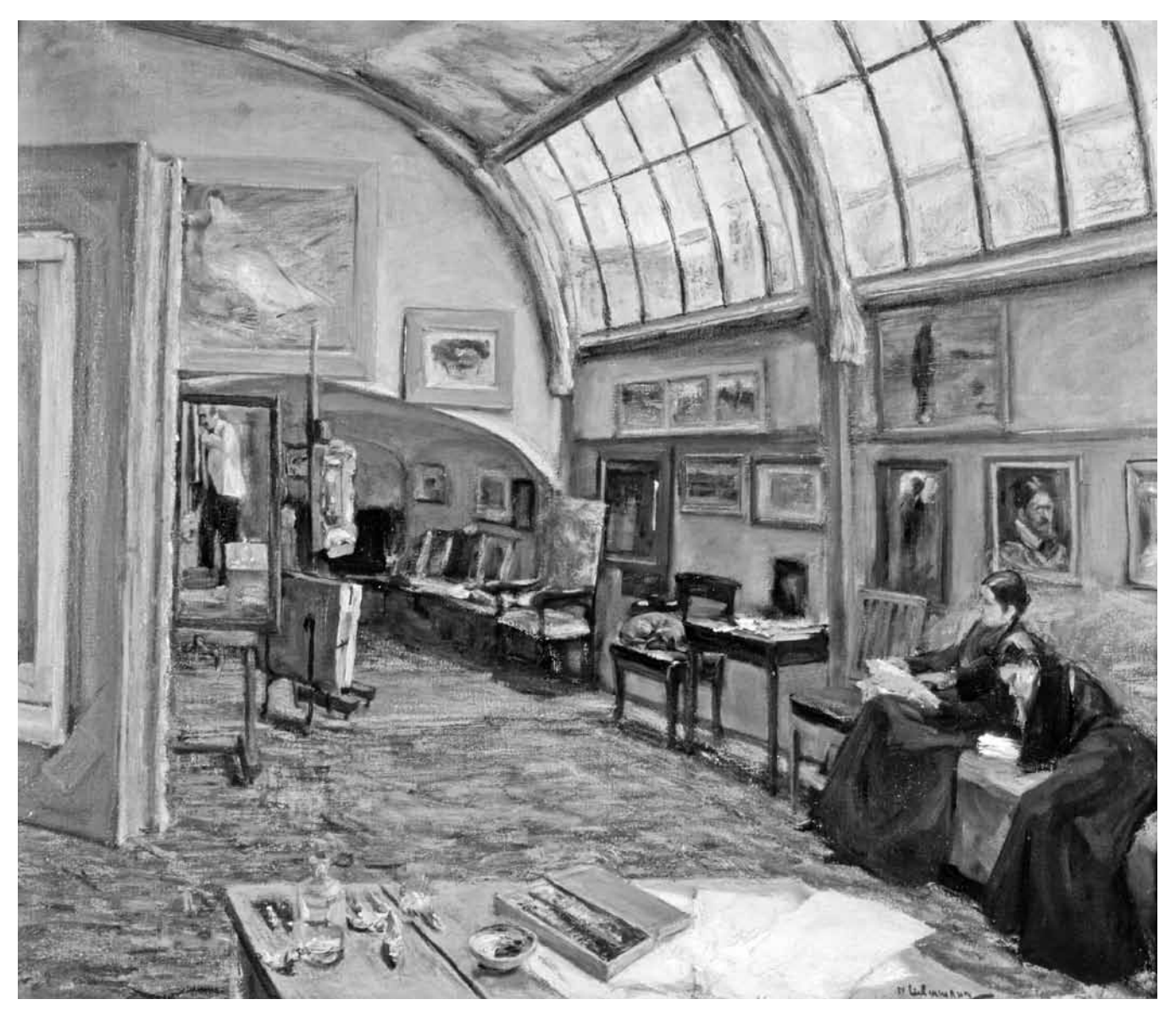
Figure 1. Max Liebermann, The Artist's Atelier , 1902. Oil on canvas, 68.5 x 82 cm. Kunstmuseum St. Gallen. Acquired from the Ernst Schürpf-Stiftung, 1951 (Photo: Courtesy of the Kunstmuseum St. Gallen).

But he also does not want to limit art to the realm of pure senseimpressions, arguing instead that his work functions in the territory of painterly thought.