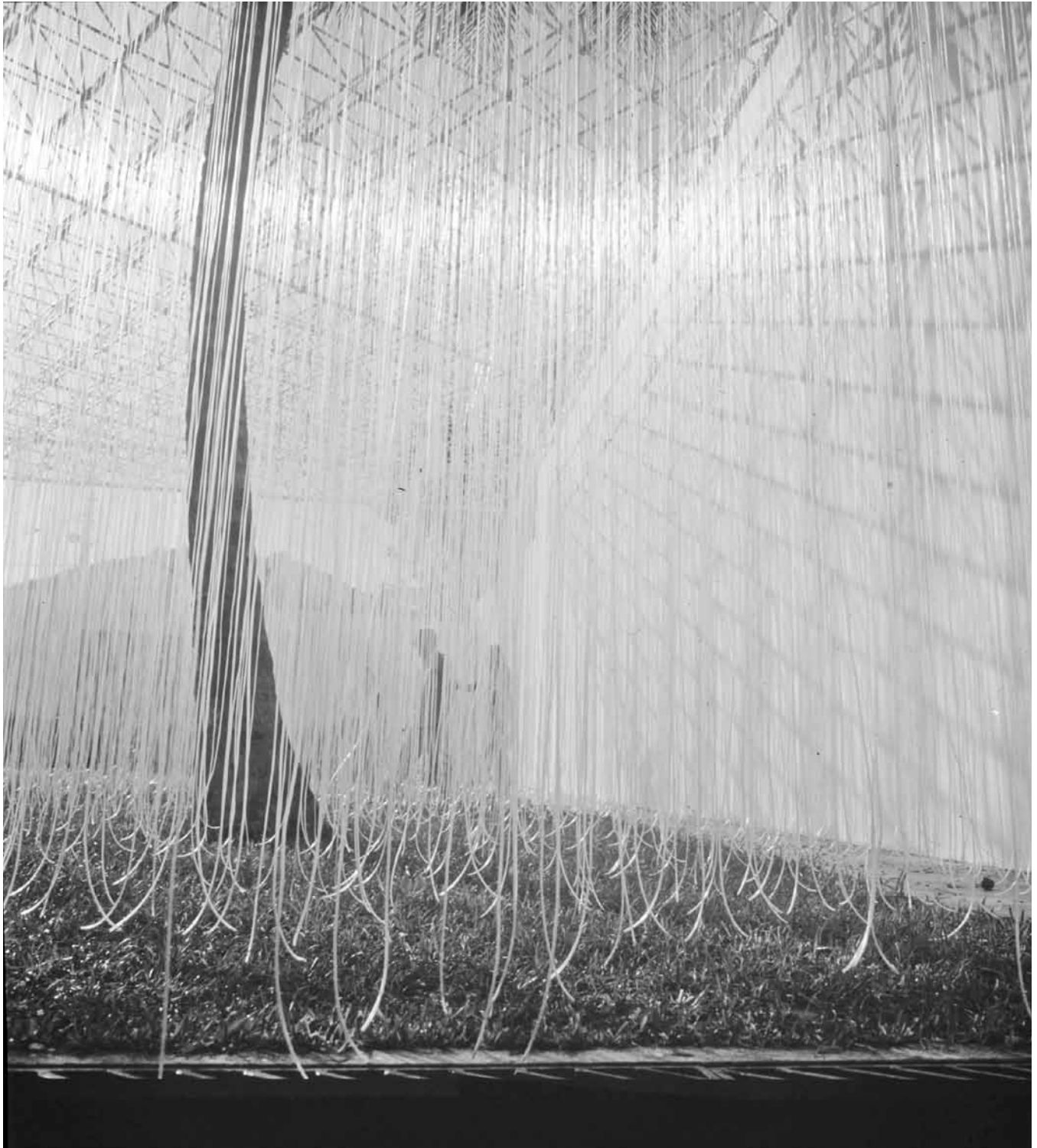
Figure 2. Jesús Rafael Soto, Penetrable de Pampatar, 1971. 300 x 1000 x 400 cm.