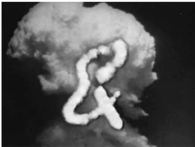
ABOVE: reasonable & senseless : “&” channel, 54 sec., 2008. Animated smoke ampersand superimposed upon a nuclear mushroom cloud video. https://vimeo.com/26110747 .

There is a form of thinking inherent in making that can never be fully stripped from object-hood. The art object is not just a thing; it is a thing in flux. At times it is merely an expensive object, at others, a deeply affective encounter charged with meaning, and, most often, both at once. In a studio visit with unfinished work, the artist and the viewer conjointly confront creative struggles in a shared encounter. In opening to unfurling work we engage in a phenomenological co-creative trajectory.