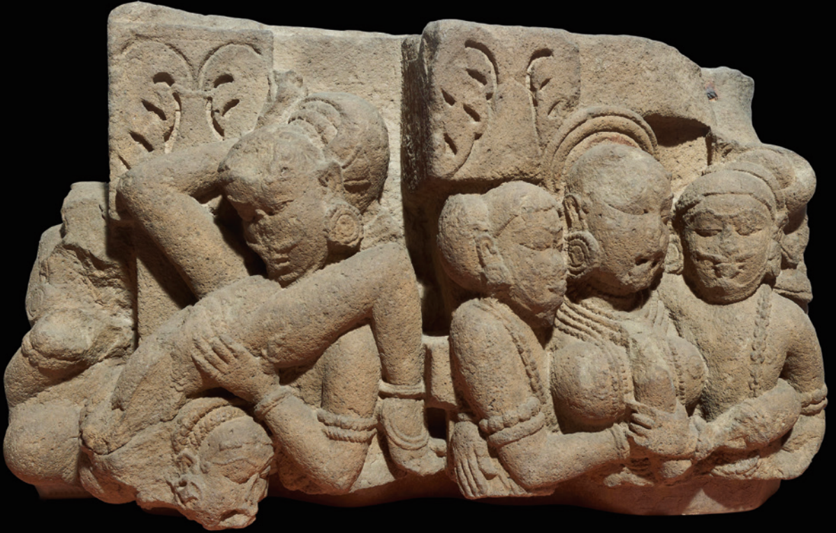
Fig. 1 Sandstone Architectural Fragment, 11th century, South Asia, probably western India.