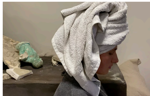
Fig 8. Nina Sanadze, Embedded , 2020. Still from short experimental film, 11 mins.

Now, in isolation with my family during the times of pandemic, I found myself again surrounded by the artefacts of Topuridze's practice in a domestic setting, on the other side of the world. It is an eerie evocation of my childhood experience which I have tried to capture and contextualise in my experimental short films Terminus | fig. 7 | and Embedded . | fig. 8 |