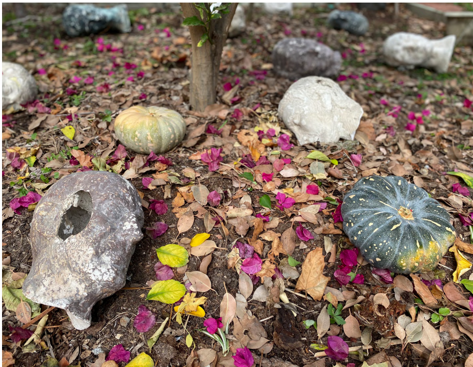
Fig. 7. Nina Sanadze, Terminus , 2021. Still from short experimental film, 34 mins.

Now, in isolation with my family during the times of pandemic, I found myself again surrounded by the artefacts of Topuridze's practice in a domestic setting, on the other side of the world. It is an eerie evocation of my childhood experience which I have tried to capture and contextualise in my experimental short films Terminus | fig. 7 | and Embedded . | fig. 8 |