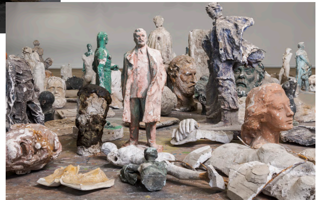
Figure 6. Nina Sanadze, Apotheosis , ACE Open, Adelaide, Australia, 2021. Studio archive of Soviet sculptor Valentin Topuridze (1907–1980), plaster models, moulds and fragments, dimensions variable.