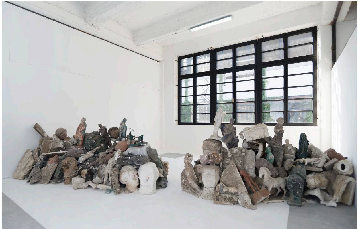
Figure 3. Nina Sanadze, 100 Years After, 30 Years On , 3rd Tbilisi Triennial, Georgia, 2018. Studio archive of Soviet sculptor Valentin Topuridze (1907–1970), plaster models, moulds, fragments and traces, plaster powder, acrylic paint, dimensions variable.