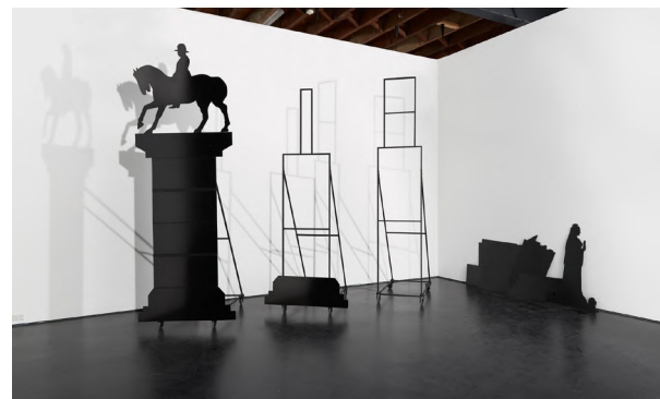
Fig. 10. Nina Sanadze, Monuments and Movements , Margaret Laurence Gallery, Melbourne, Australia, 2019. Steel, epoxy enamel paint, aluminium composite panels, castor wheels, dimensions variable.