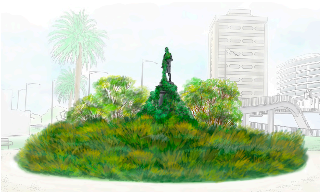
Fig. 11. Nina Sanadze, Grass Monument , drawing for the proposed project, Captain Cook monument, St Kilda foreshore, Melbourne, Australia, 2020.

Presenting appropriated original artefacts, replicas, or documentary films as witnesses and evidence, I seek to re-examine our grand political narratives from a personal position. Having no answers, but many questions, I see my work as a series of provocations, practice or rehearsals with speculations. ¶