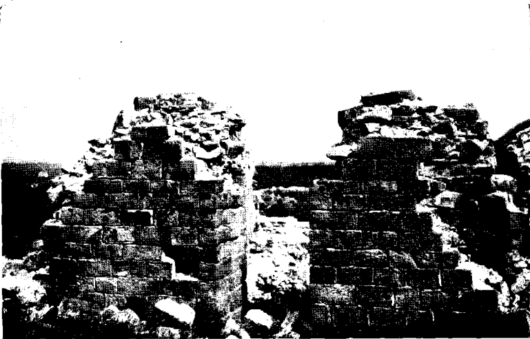
Ruins of Fort Cumberland, N.S., (Photo., Can. Nat. Parks).