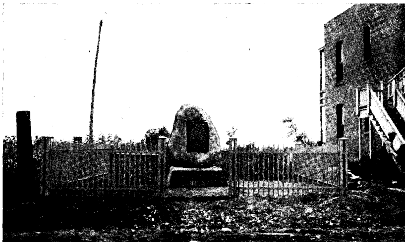
Site of Battle of Three Rivers, Three Rivers, P.Q.

A cairn and tablet were erected in a small park which now occupies the site of the old fort. This was a refuge for the settlers during a quarter of a century of wars, 1687-1713, and was the scene of an unsuccessful attack by New England States Militia troops during the nights of August 10 and 11, 1691. The unveiling ceremonies were carried out on September 23 last, in accordance with arrangements made by the town of Laprairie.