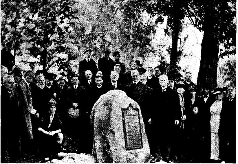
Unveiling ceremonies, Ste. Marie II, Christian Island, Ont.

Fathers Breboeuf and Lalement and of the Huron village captured by the Iroquois on March 16, 1649. The unveiling ceremonies were carried out on September 15, 1923, the necessary arrangements having been made by the Penetanguishene Historical Society.