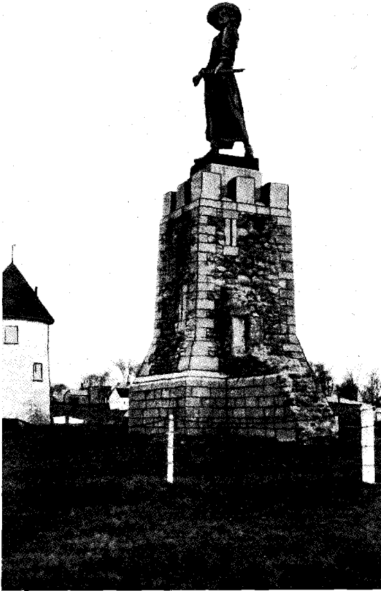
Madeleine de Verchères Monument, Verchères, P.Q.

the attacks of the Iroquois in 1692, and thereby saved the settlement, was transferred for maintenance from the Department of Public Works. Part-time caretaker appointed. Tablet to be erected.