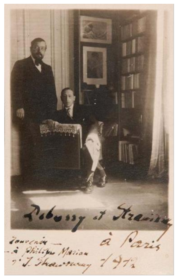
Figure 15: Debussy and Stravinsky, photo 1912.