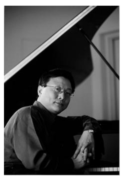
Figure 10: Bright Sheng.

Ellen Zwilich sees growth by color differentiation as an essential forming process: Timbre is an agent of form, a building block." [I had inquired into such a procedure in Symphony No. 4, The Gardens .] Zwilich continued: