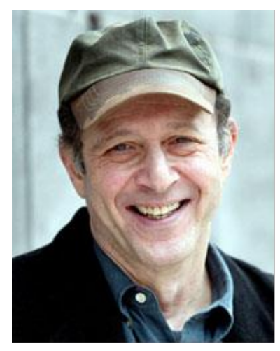
Figure 14: Steve Reich.

You don't feel the ghost of Wagner leaning on your shoulder... you feel the presence of Debussy and Ravel... So the French connection runs deep. With the exception of Charles Ives, who is really more Germanically oriented, actually, it seems to me, our most important, most famous (historically) American composers come out of the French tradition... I know I've heard people say, 'Oh, Charlie Parker has heard Debussy...' I think bebop in general is definitely somehow a cousin of French impressionism.