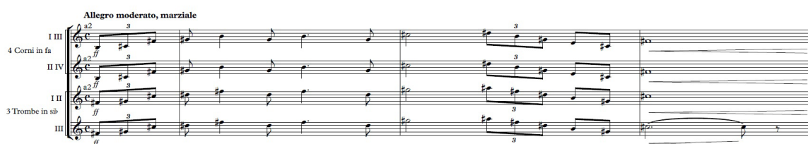
Example 11: Gian Francesco Malipiero, Giulio Cesare (1936), heroic motif associated with Caesar, mes. 1-3, p. 1

In Giulio Cesare , Caesar dominates the opera musically, overshadowing the other male protagonists despite his old age and frail health. A heroic motif associated with Caesar opens the opera and sounds when he is about to come onstage and when other characters talk about him (Example 11 and Audio excerpt 7). Surprisingly, the full motif never accompanies Caesar. Though his successor Ottaviano (Augustus) appears at the end of the opera, the heroic motif continues to refer to Caesar rather than to him, casting ambiguity on the virility and legitimacy of Caesar’s successor (Figure 2). Furthermore, as shown in Figure 2, once Ottaviano appears, the full motif is not played again until the end of the opera. As in the case of Ottaviano in Antonio e Cleopatra , this musical expression of conventional manhood could be interpreted as an operatic expression of public virility. In Giulio Cesare the motif appears to be associated with Caesar’s spirit, or with Caesar the public figure, but not with Caesar the man. Whereas the private dimension of political leaders does not stop them from public expressions of virility in dramas, in opera, the private dimension of the protagonists seems to preclude virility: public virility, instrumental or choral, can only be expressed in the protagonist’s absence.