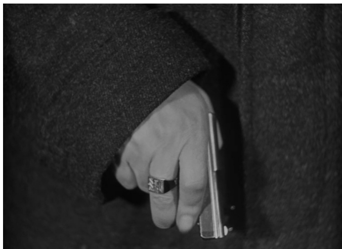
Video excerpt 3: Alessandro Blasetti, Resurrectio (1931), the hero's very small gun, 07:02-07:23

conductor has reformed and can now resist the temptress thanks to his love for the virtuous young woman (referred to only as “the girl” – “ la fanciulla ”).