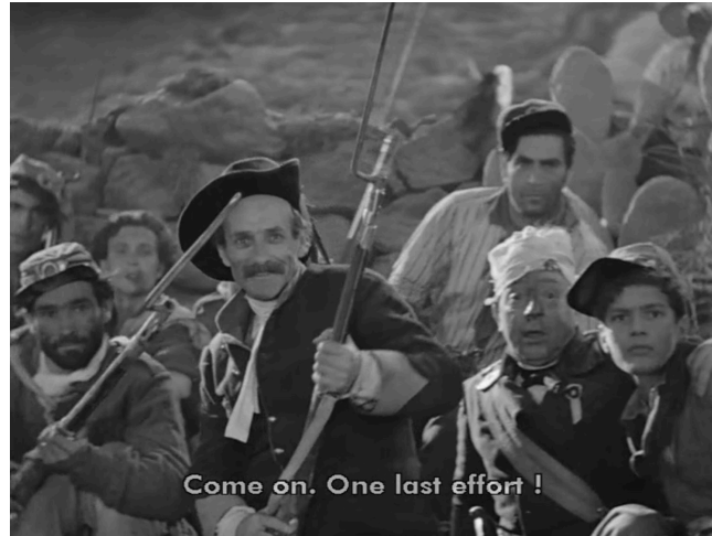
Video excerpt 2: Alessandro Blasetti, 1860 (1933), Garibaldi's voice rouses soldiers to battle, 01:10:25-01:10:53

The renegade political leaders of dramas are not discussed separately from the other two character types in the literature; yet, their treatment differs significantly from both the virile political leaders of historical films and the effete lovers of comedies. Although they evade their duties, they cannot be presented as weak in the same way as the protagonists of comedies because of their possible comparison with Mussolini in their role of condottieri . In Terra madre (Blasetti 1931), the protagonist – a landowner distracted by city-life – has forgotten his duties to the peasants who work for him. Though corrupted by city values (and city women), he has not lost his virility: he wrestles a bull and holds him by the horns with his bare hands in front of a cheering crowd and he later runs into a burning house to save a child. Though he needs to be reminded of his duties as a leader (by a virtuous woman), his masculinity remains intact and, as in the case of Scipione and Garibaldi, the camera often films the adoring gaze of the people upon him. The hero's virility is, once again, expressed and validated through public adoration.