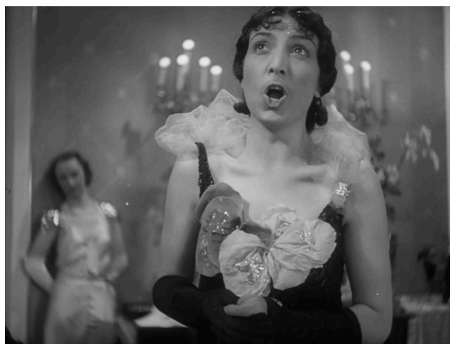
Video excerpt 1: Mario Camerini, Ma non è una cosa seria (1936), operatic performance bores audience, 13:26-13:43