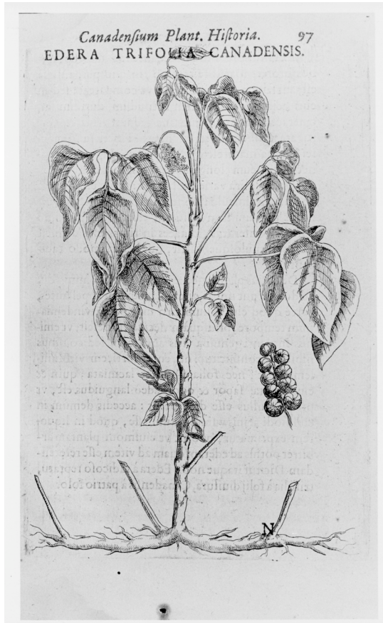
Figure 3. Edera trifolia Canadensis , or Poison ivy ( Toxicodendron radicans ).

Source: Engraving in Jacques-Phillipe Cornut, Canadensium Plantarum aliarumque nondum editarum Historia (Paris: S. le Moyne, 1635). Courtesy of Agriculture Canada.