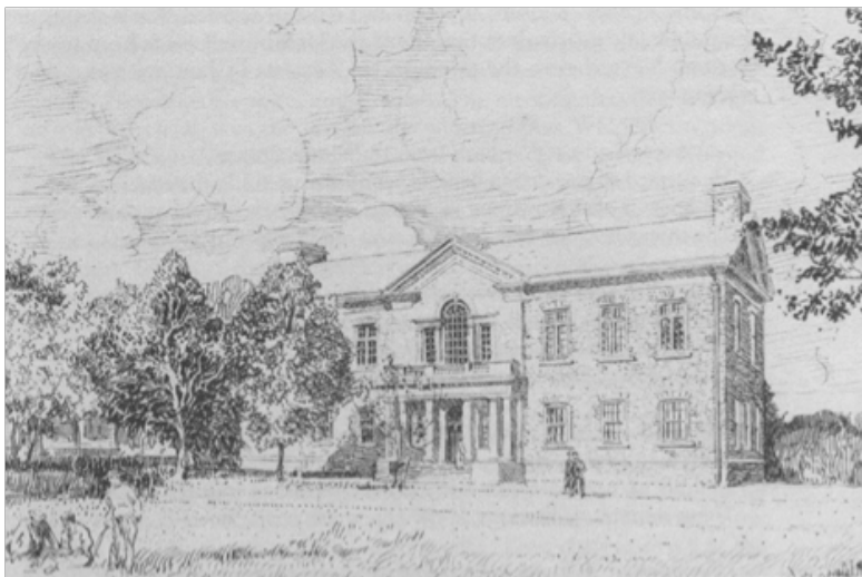
Source : Sketch by Arthur Lismer.