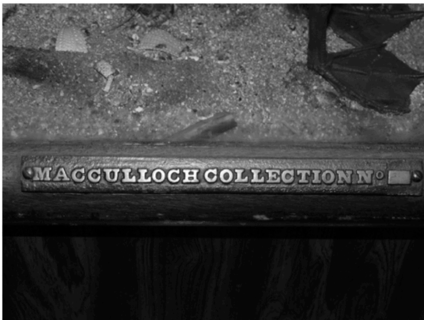
Figure 5. Case label from the 1924 refurbishing of the McCulloch Collection. The misspelling of the McCulloch name was a primary clue to the re-housing of the collection.