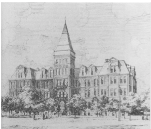
Source : Sketch by Arthur Lismer. With permission of Dalhousie University.

Figure 2. The Forrest Building, Dalhousie University, in 1900. Dalhousie College moved into this building in 1887. The McCulloch Collection was housed here 1887-1915 and 1953-1971.