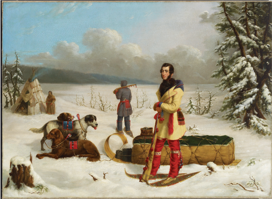
Figure 1. Paul Kane, Canadian, 1810–1871. Scene in the Northwest - Portrait, c. 1845–1846. Oil on canvas. Overall: 55.5 x 76 cm (21 7/8 x 29 15/16 in.). The Thomson Collection © Art Gallery of Ontario, 2009/507.

operated within a Humboldtian network and paradigm, in their approach to doing science. 1 Zeller has positioned Lefroy in such a way largely because of his involvement in a magnetic survey of parts of what was British North America, Rupert's Land and the Northwest Territories, today collectively known as Canada, between May 1843 and November 1844. This survey was a constituent part of a wider geomagnetic project, known as the magnetic crusade—which was coordinated at and by Edward Sabine's magnetic department at Woolwich, England and Humphrey Lloyd's Dublin Observatory, Ireland. The magnetic crusade was in operation from 1839 to roughly 1854 and was made up by a combination of observation at fixed magnetic and meteorological observatories—both within and beyond the boundaries of the British Empire from Europe to South Africa to Australia—and by observation on a number of mobile surveys, of which Lefroy's was one. 2 The magnetic crusade was the most extensive and ambitious project of the early nineteenth century, a "combination such as the scientific world never before saw" according to Lloyd, who similarly expected that the results of such an enterprise would "correspond with the gigantic magnitude of the machinery." 3