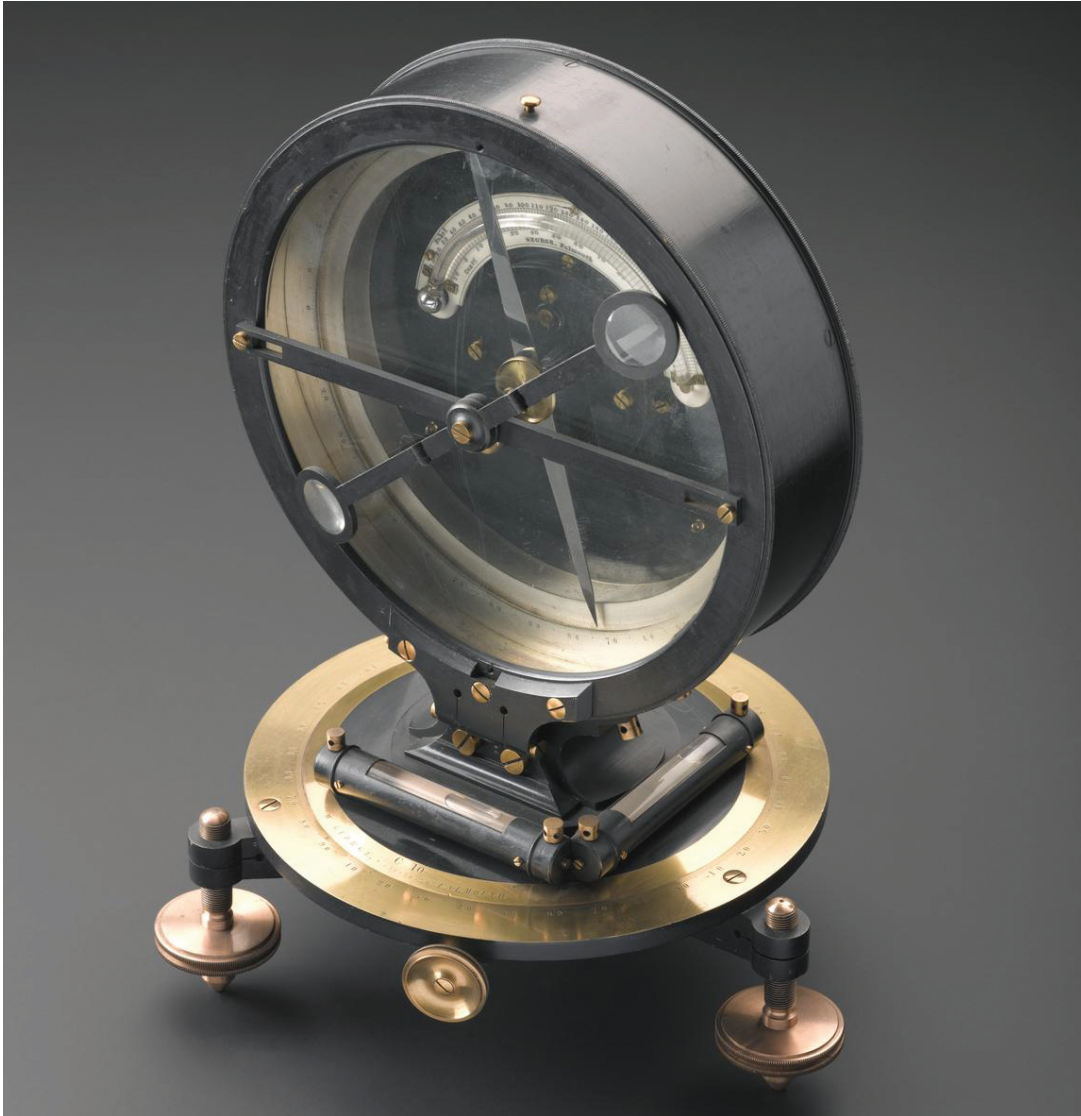
Figure 2. Example of a Robert Were Fox dip circle made by W George of Falmouth, Cornwall, England, c.1840.

jacket, two chamois leather shirts and two chamois leather drawers. 38 Lefroy also gave red shirts to Baptiste and Roubillard, two of the voyageurs on the survey, “by way of uniform.” 39