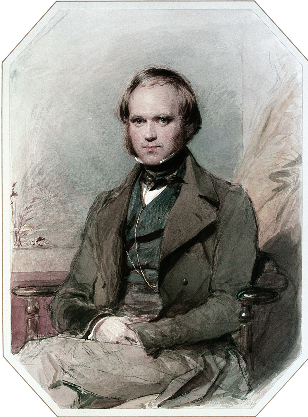
Figure 1. Water-colour portrait of Charles Darwin, after his return from the voyage of the Beagle, by George Richmond, 1830s.