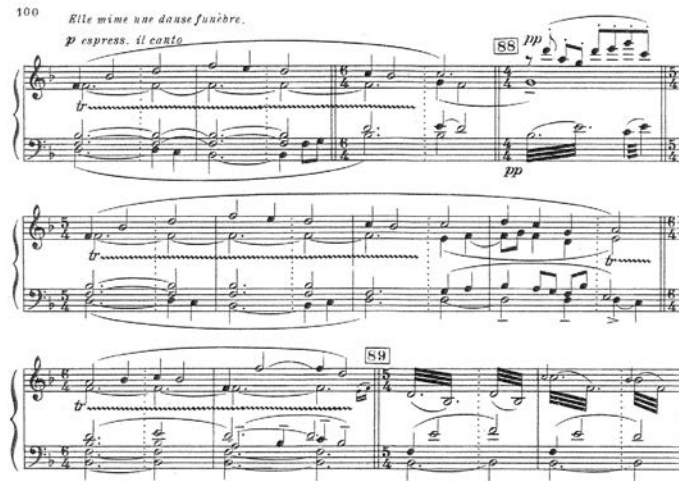
Example 4 Maurice Emmanuel, Salamine (1929), Act II, sc. 1 (VS 100).

expression seen in the placement of one hand on the head and the other directed toward the dead body. In Emmanuel's Figure 543 one can see the earlier depictions of the ritual, which were later replaced by the stylized gesture in Figures 551 and 553 (See Figs. 1a and 1b). Emmanuel described these latter poses as "prototypical" funeral gestures, and stated that although the ritual of tearing the hair had been lost, the gesture had been retained; moreover, Emmanuel described the dance for these funeral rites as "full of calm" versus the violence of the threnodic hair pulling. 10