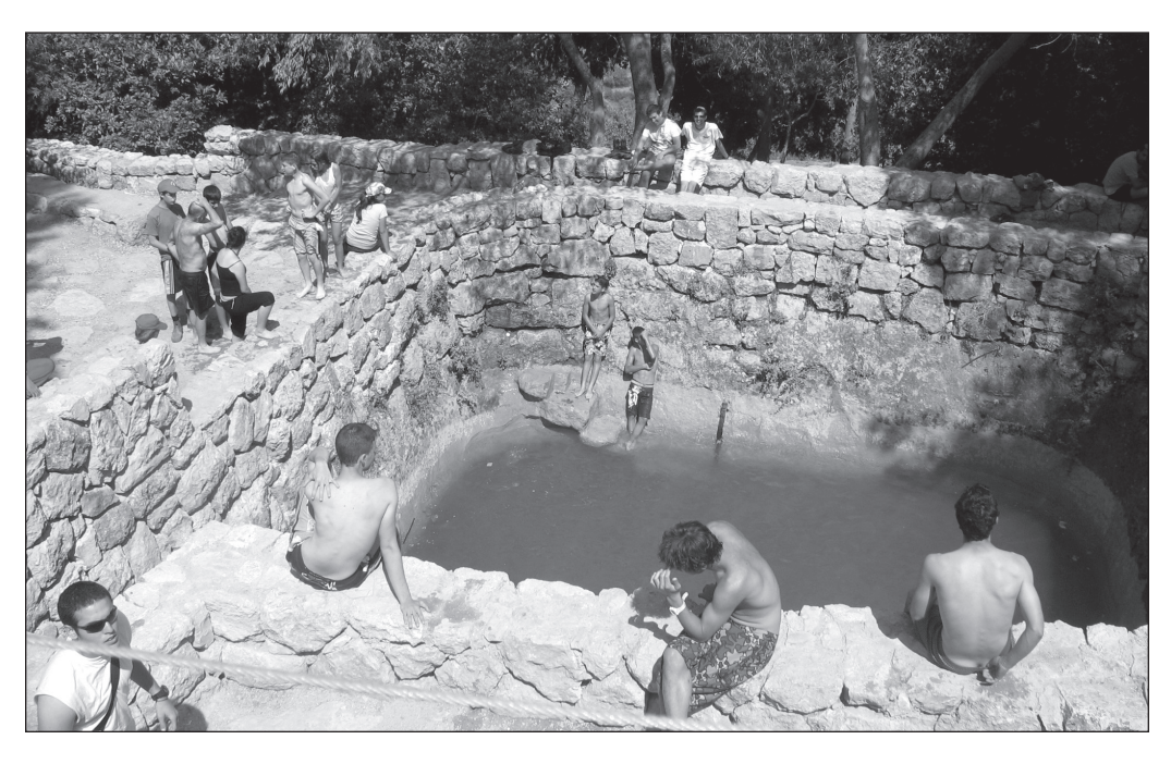
FIGURE 2: Sataf recreation area managed by the JNF, in the depopulated village of Sataf.

NPA that direct visitors to different parts of the sites, and 80% of the names do not appear on maps adjacent to the JNF publications or on signs.