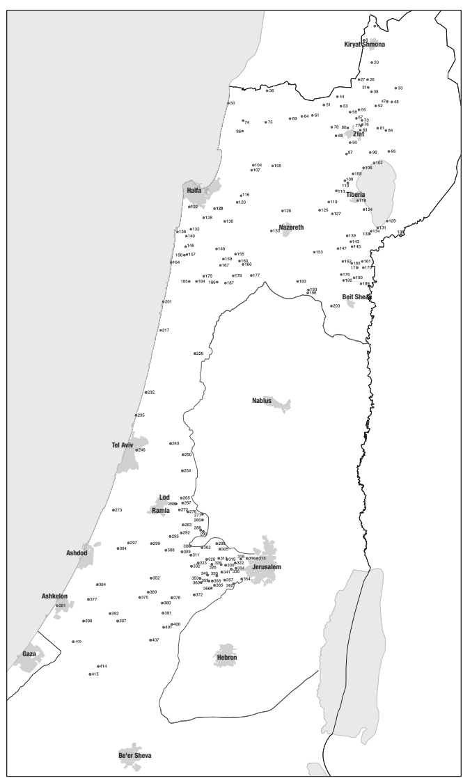
FIGURE 1: Palestinian Depopulated Villages in Tourist Sites in Israel (source: Mapa Publishers in Kadman, 2008, Tel Aviv, Israel).

that in addition to making claims about Israeli Jewish identity and citizenship, they are "a significant force in the process of both physical and symbolic displacement of Palestinians in Israel" (Bauman, 209; see also Benvenisti, 2000: 168-169, 299-303; Meishar, 2003: 307-310, 321).