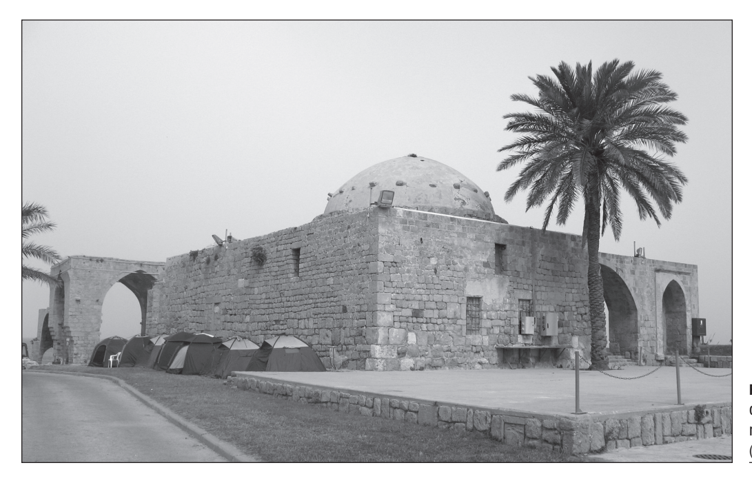
FIGURE 3: Remains of the depopulated village of al-Zib, now in the Achziv National Park.

but this mention is directed to the Jewish settlement, while the Arab village is mentioned only incidentally. The Dana village, for example, is mentioned as the dwelling of an ancient Jewish site, and not as a village in its own right, which existed in the same place for hundreds of years: