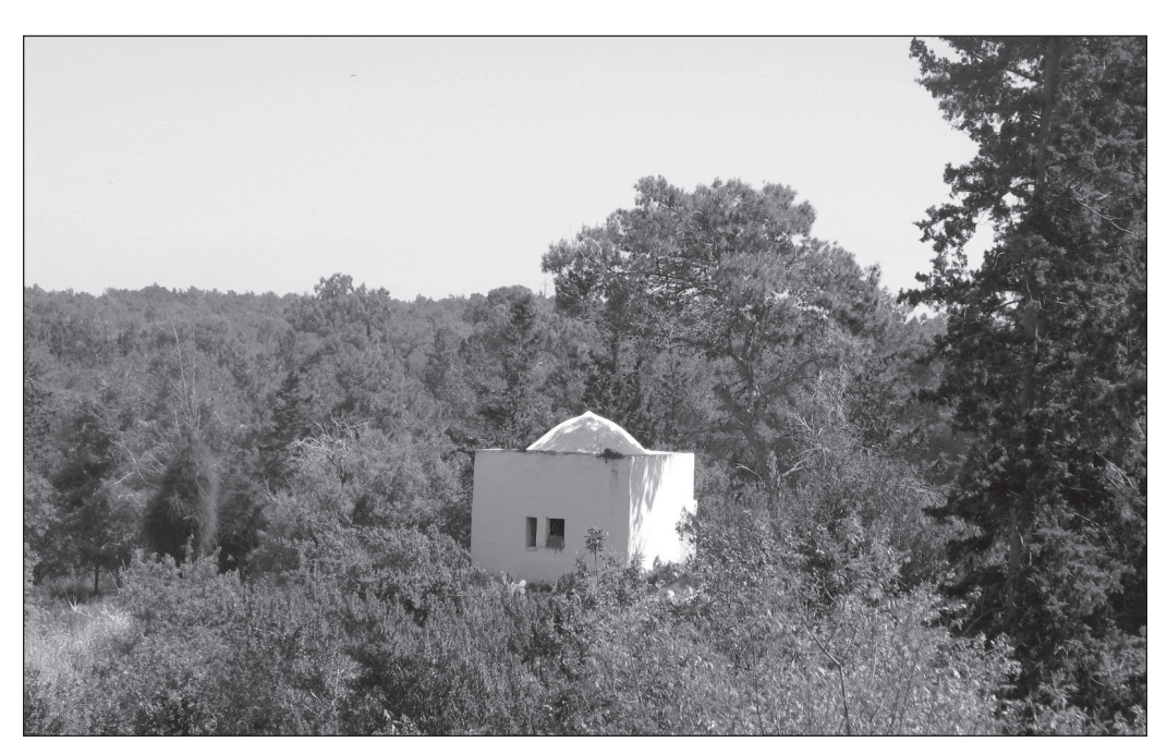
FIGURE 4: The only remaining structure of the depopulated village of Ayn Ghazal, now within the Carmel Beach Forest.

JNF publications. In certain cases, JNF texts refer to "structures of the Othman period," without saying these are structures of an Arab village that was located there in the Othman period and also beyond, until 1948. Using the term "Othman" and emphasizing the crusader period of village sites fit well the tendency to present the historical periods between The Jewish exile to Babylon up to the establishment of the state of Israel as a sequence of foreign occupations, while ignoring the local Arab population who lived in the country at the same time (Benvenisti, 2000: 303).