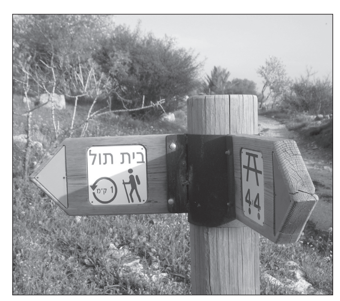
FIGURE 6: A JNF sign presenting a hiking trail with mention of the name of the depopulated village of Bayt Thul.

Most of the villages that are mentioned in NPA texts were depopulated due to artillery attacks; residents were deported from a few other villages, and residents fled from still other villages in fear of being attacked (Morris, 1991: 586-592). None of these events are cited in NPA texts, except the evacuation of Kafr Bir'em (see below). The first planned deportation executed by the Hagannah Jewish forces, which caused the depopulation of the village of Qisarya in January 1948 (p. 82), is not included in signs or publications about the place. The entrance sign of the Caesarea National Park only says that the village that stood there "did not last long," without any other explanation. This village is mentioned in the park brochure, but with no hint that it no longer exists (NPA, 1998). Similarly, the sign that the NPA