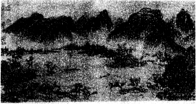
秋江平远图局部 黄筌画 北京故宫博物院藏

From Tang Song Yuan Ming Minghua Daguan .