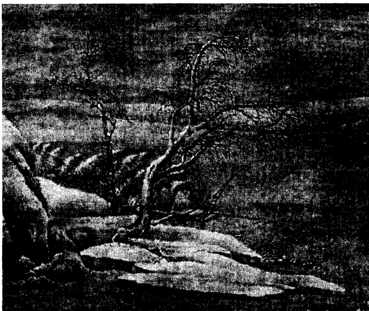
ma lin 独钓寒江雪 Fishing alone on a cold river, by Ma Lin, Song 960-1279