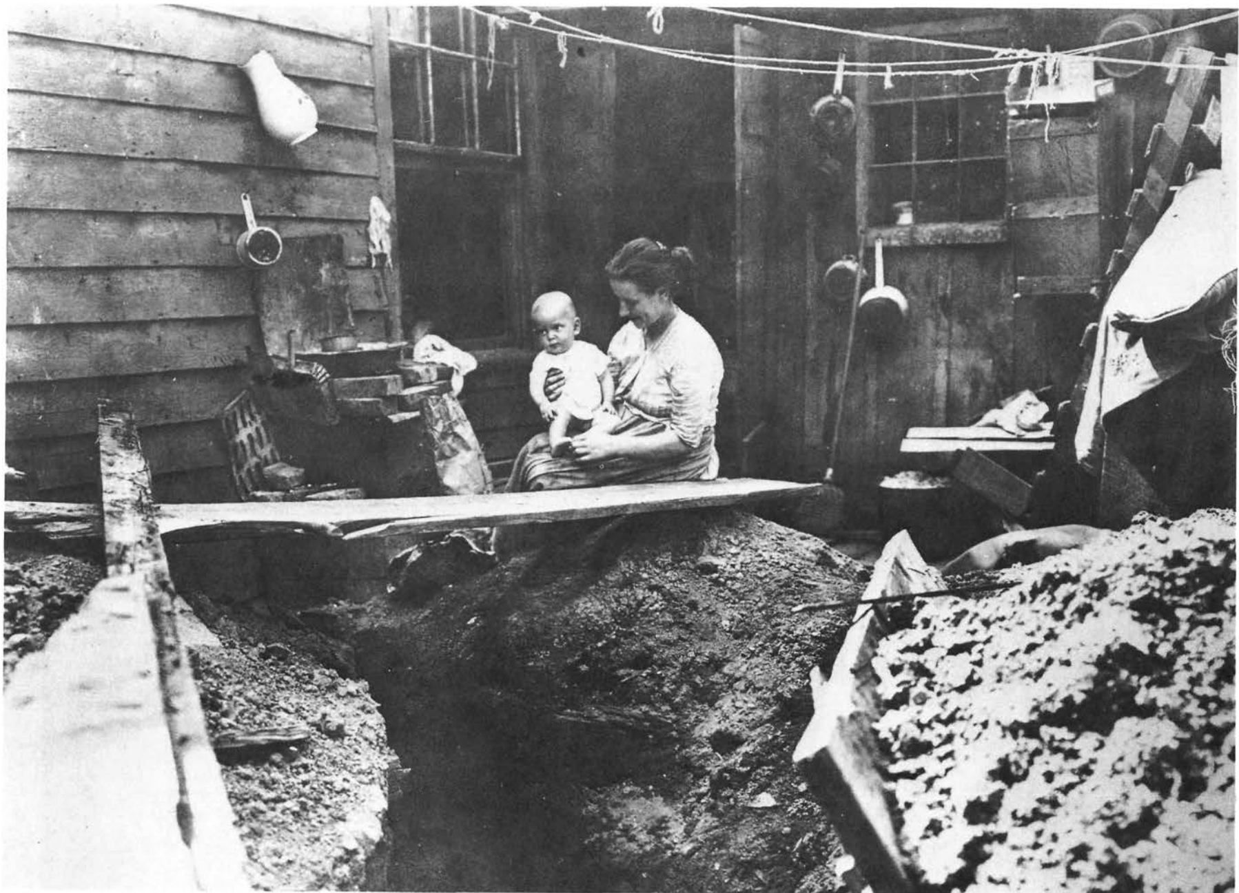
Summer 1912. Rear of #94 Elizabeth Street. Drain being installed to connect with Chesnut Street Sewer.