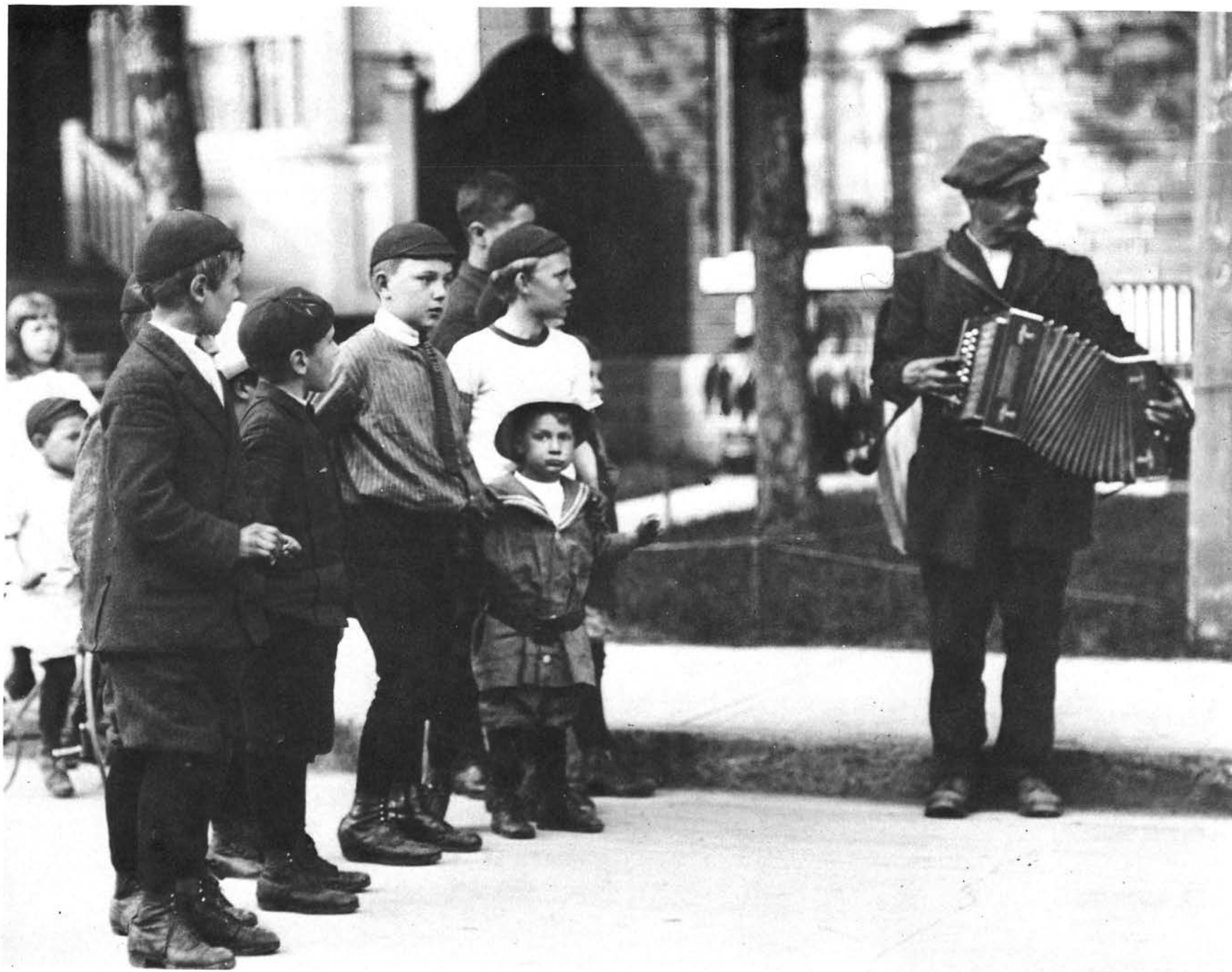
Major Street, 1912.