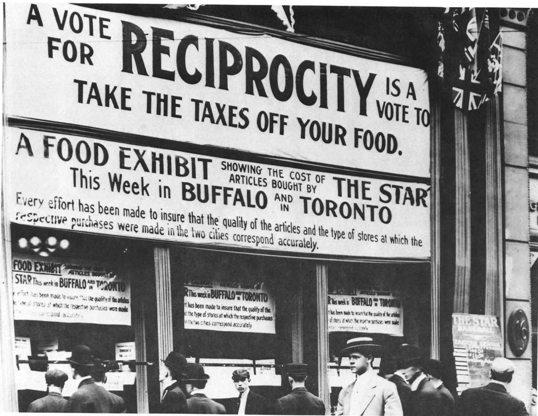
Toronto Star building, #18 King Street West, 1911